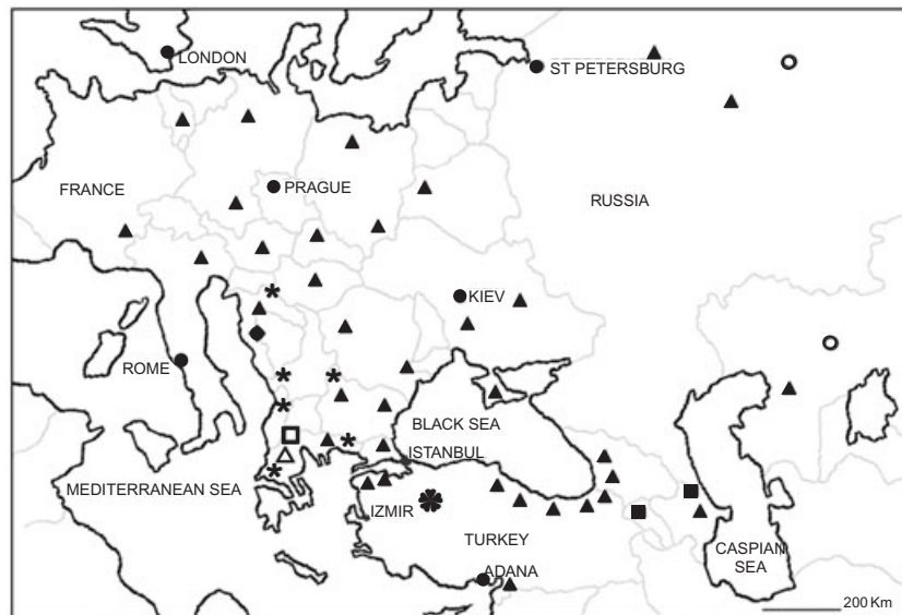
Figure 2. Distribution map of Hesperis turkmenaghensis (*), H. matronalis (▲), H. verroiana (□), H. pseudonivea (○), H. hirsutissima (■), H. rechingeri (△), H. theophrasti (★) and H. siliquo-glandulosa (◆).

(specimen no. A.Duran 5007). Although the reticulum wall of H. turkmenaghensis is rectangular and thick (12.5 µm), it is polygonal and thin (5 µm) in H. matronalis . The wart is situated in the middle of the lumen in H. matronalis , but it is situated close to the wall in H. turkmenaghensis (1 µm) (Figs 4, 6). In addition, the seed coats of H. matronalis ssp. adzharica were studied by SEM. H. matronalis ssp. matronalis and H. matronalis ssp. adzharica are very similar in their seed coats surfaces characteristics (Figs 7, 8).