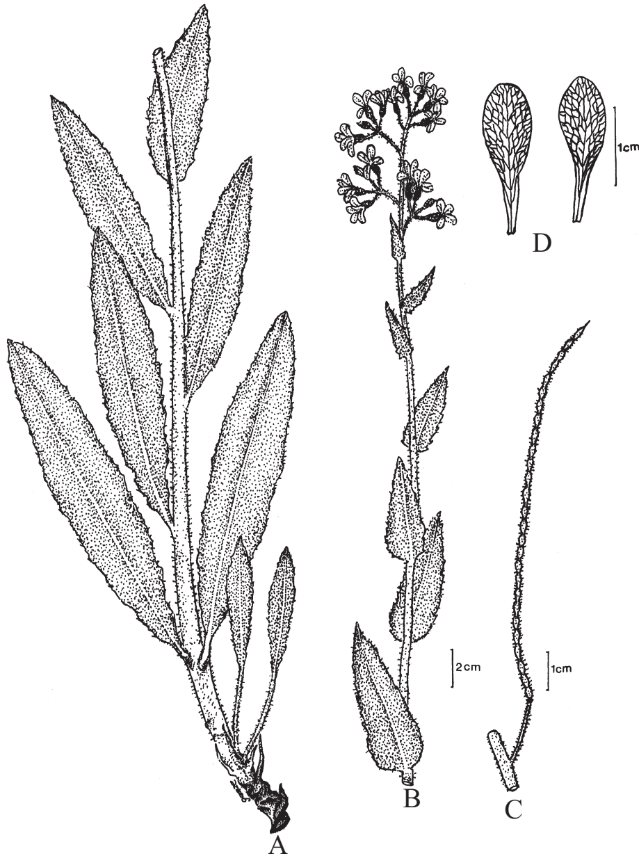
Figure 1. Hesperis turkmendaghensis A. Duran & A. Ocak sp. nov. A, B, habit. C, pedicel and silique. D, petals.

serpyllifolia L., Helichrysum graveolens (Bieb.) Sweet, Campanula tokurii A.Ocak (local endemic), Astragalus stereocalyx Bornm. (endemic), Saponaria chlorifolia Kunze (endemic), Consolida aconiti (L.) Lindl. (endemic), Pilosella echioides (Lumn.) Schultz Sch. & F.W.Schultz, Tanacetum sp., 1500–1700 m altitude, hemicryptophyte.