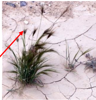
Fig. 2 Aging grass