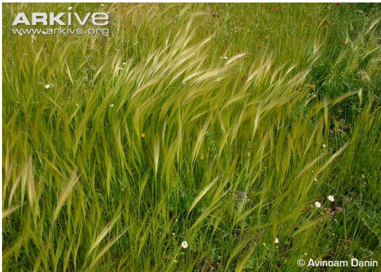
Fig. 3 Dense stand of needle grass