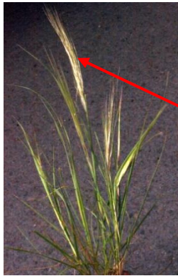
Mediterranean needle grass Stipa capensis Grass family (Poaceae)

Bristles Pointing upward Beginning to bend outward