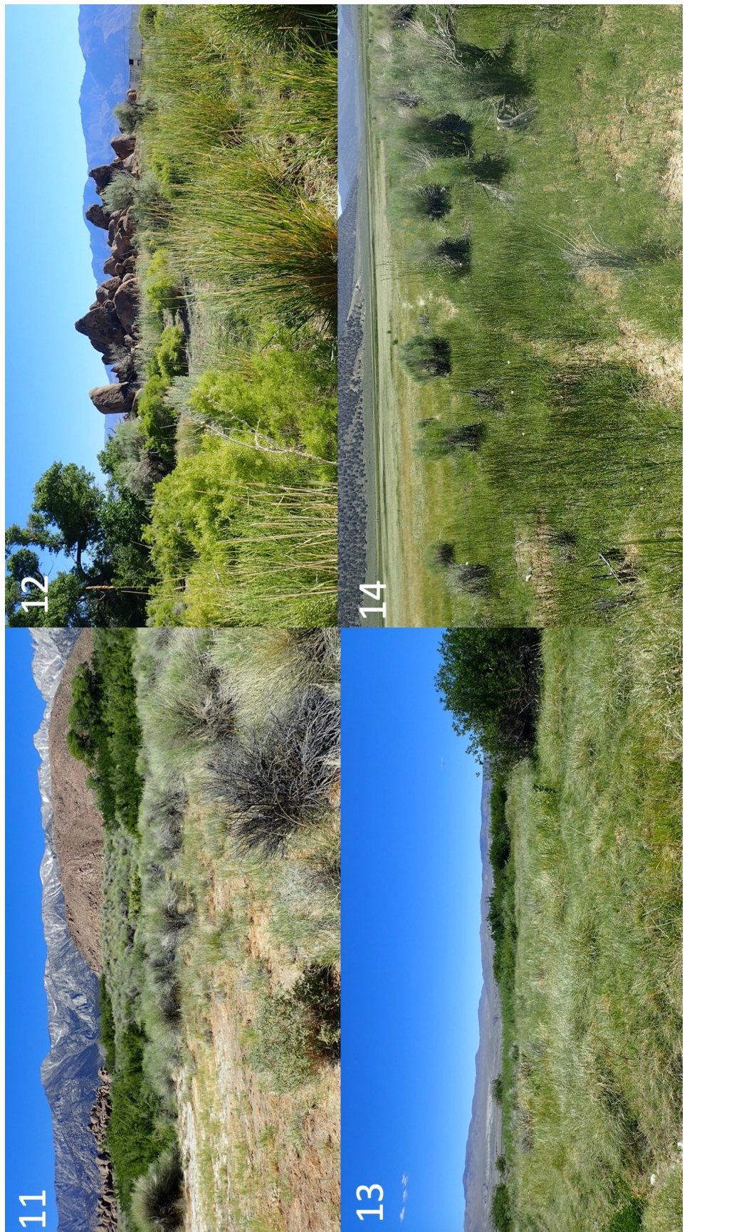
Fig. 11–14. Calochortus excavatus habitat seen at four CNDDB element occurrences in 2020.—11. Margins of alkali meadow seen at EO3.—12. Sarcobatus vermiculatus (Hook.) Torr. and other associated taxa in the Alabama Hills at EO32.—13. A meadow behind Baker Creek Campground supports Calochortus excavatus and Sidalcea covillei Greene, another endangered plant with the CNPS rank 1B.1, at EO13.—14. The marshes on the north shore of Black Lake face vegetation type conversion to Ericameria nauseosa shrubland at EO9.