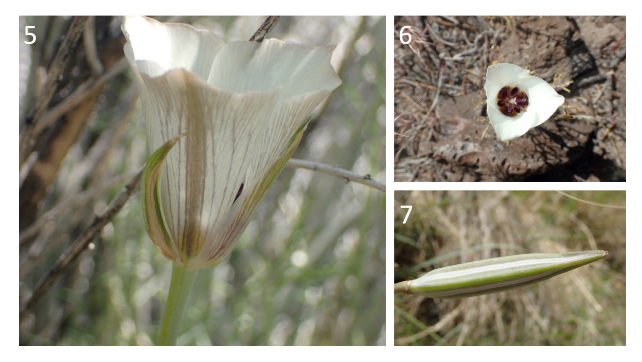
Fig. 5-7. Calochortus excavatus flowers and fruit.—5-6. Mariposa lily floral form.—7. Spear-shaped fruit.