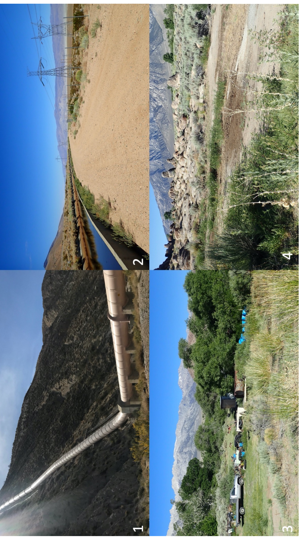
Fig. 1–4. Threats facing Calochortus excavatus .—1. LA aqueduct transporting water from the Owens Valley to Los Angeles.—2. Development relating to aqueduct maintenance.—3. Human disturbance in habitat.—4. Drought and disturbance leading to vegetation type conversion.