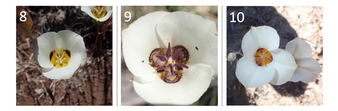
Fig. 8–10. Similar-looking Calochortus species of the eastern Sierra Nevada.—8. Calochortus leichtlinii with sagittate yellow or white anthers and a red to black spotted mark above the nectary.—9. Calochortus excavatus with dark red anthers and a dark purple petal base.—10. Calochortus bruneaunis with a red or purple arch above the nectary and variable anther color.