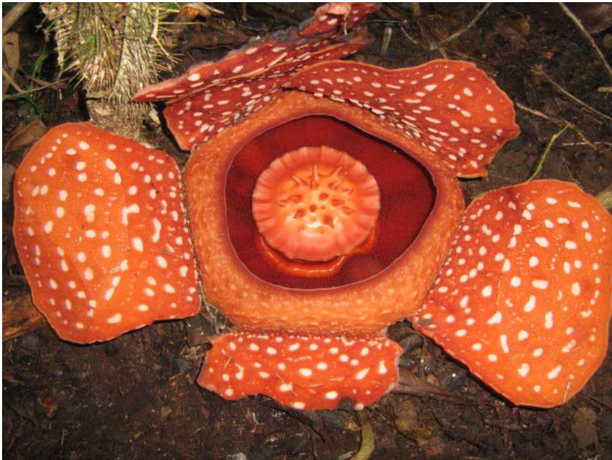
Fig. 2. Fully-bloomed flower of the newly described Rafflesia banaoana Malabrigo discovered in BBNP

was treated as synonym of Rafflesia leonardi (Barcelona et al., 2011) based solely on the photos from the author's publication (Malabrigo, 2010, p. 141-143). However, careful examination of R. leonardi photos (Barcelona et al., 2008, p. 226; 2009, p. 81; 2011, p. 13.) showed obvious and enormous morphological differences (size, color, shape of the disk, number of processes, column layering etc.) with R. banaoana . It is interesting to learn how these experts arrived at a conclusion that the two species are conspecific and those morphological differences are only developmental and/or environmental variations, where in fact not anyone from them have seen actual specimen of R. banaoana . Being the person who observed its natural population and carefully examined the species, the author strongly upholds the identity of Rafflesia banaoana as unique and different from the rest of the Rafflesia in the world.