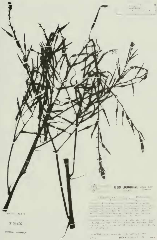
Plate 2, Pitcairnia explosiva L.B. Smith & Betancur.