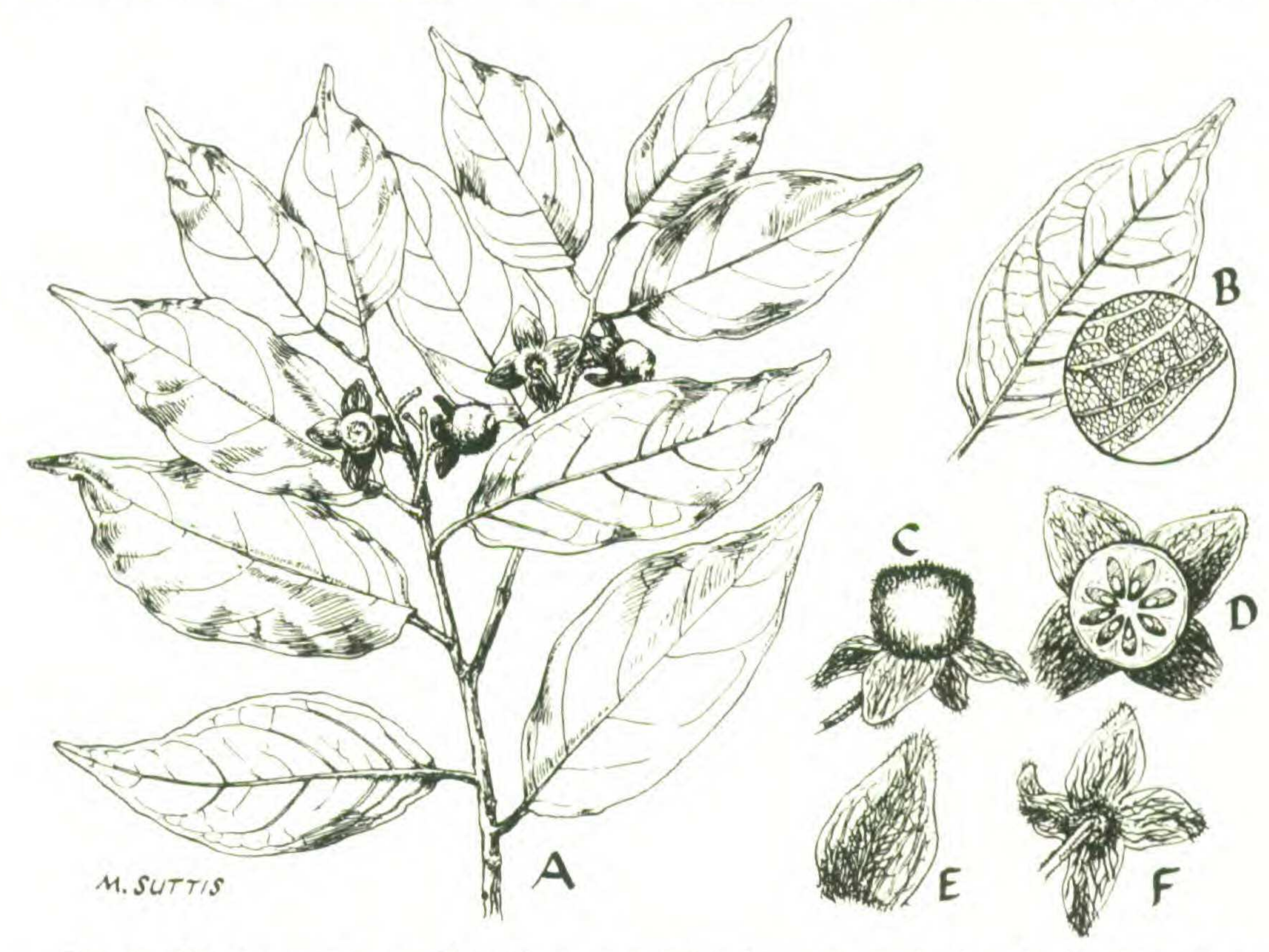
Fig. 3. Diospyros Taamii Merrill: a. a fruiting branch, \times \frac{1}{2} ; b. a leaf, with a portion enlarged to show the ultimate reticulations; c. an immature fruit, \times 1\frac{1}{2} ; d. cross-section of an immature fruit, showing the persistent sepals; e. an individual sepal, dorsal view; f. dorsal view of a fruiting calyx; all somewhat enlarged.

Arbor parva, circiter 7 m. alta, partibus junioribus fructibusque exceptis glabra; ramis teretibus, glabris, in sicco longitudinaliter subrugosis, ramulis