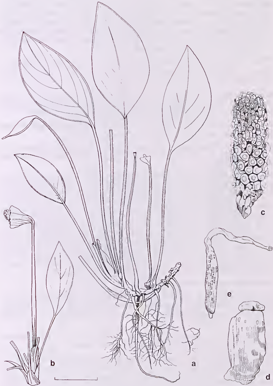
Fig. 4. Piptospatha manduensis A. Hay & Bogner. a, Habit; b, Inflorescence; c, Spadix; d, Berry; e, Seed. (Kostermans 13493a). Scale bar: a, b = 2 cm; c = 4 mm; d = 1.4 mm; e = 1 mm