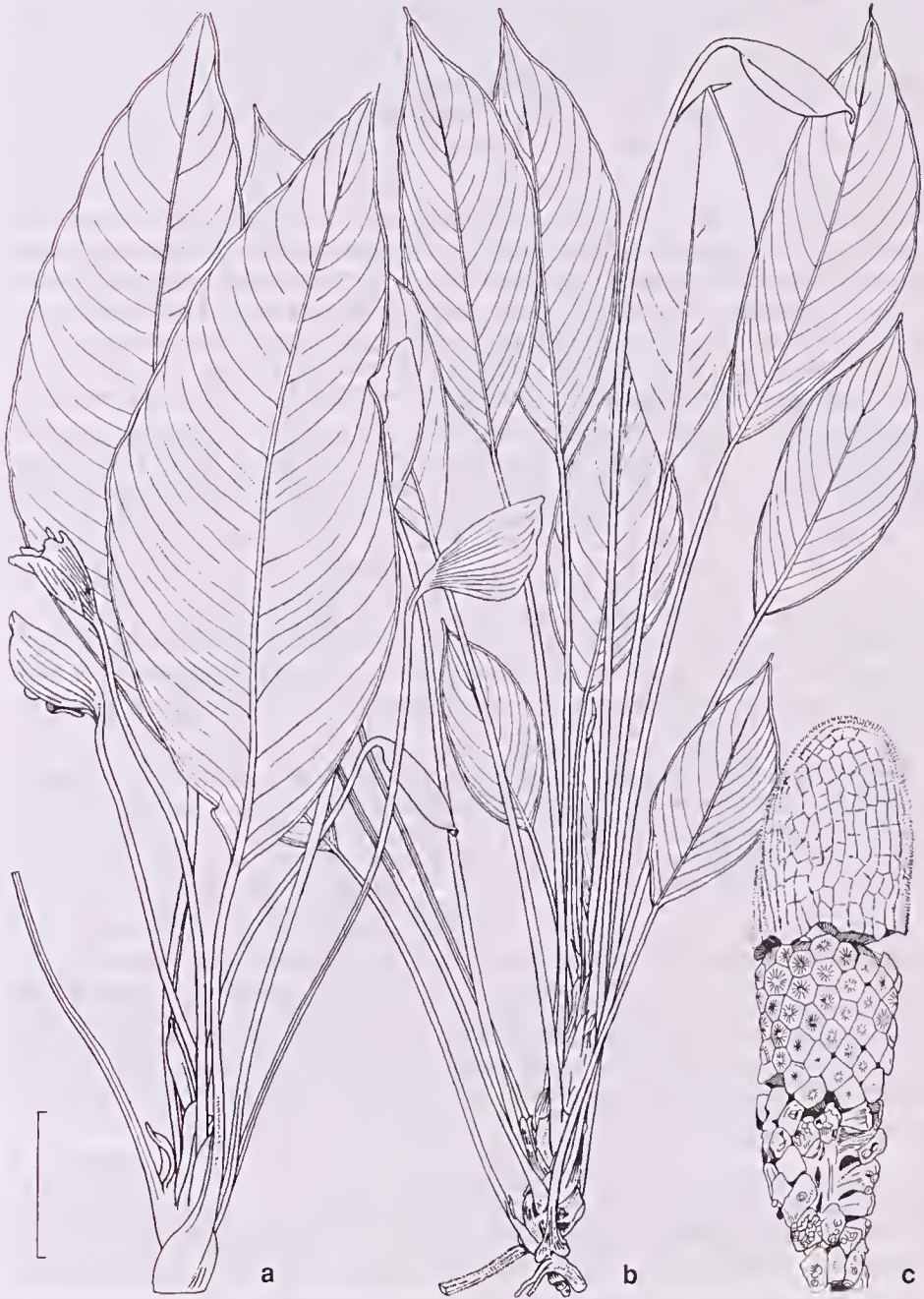
Fig. 6. Piptospatha grabowskii (Engl.) Engl. a, b, Habit, broader and narrower-leaved forms; c, Spadix. (a: Paie S 45112; b: Boyce 1434; c: Chai S 36010). Scale bar: a, b = 4 cm; c = 4 mm.