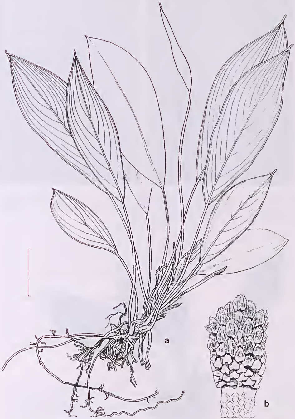
Fig. 1. Aridarum rostratum Bogner & A. Hay. a, Habit; b, Part of spadix showing top of female zone, interstice and base of male zone. (Winkler 1066). Scale bar: a = 3 cm; b = 4 mm.