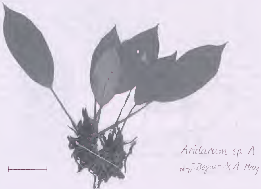
Fig. 3. Aridarum sp. A. Whole plant (Ilias & Azahari S 35676). Scale bar: = 3 cm.