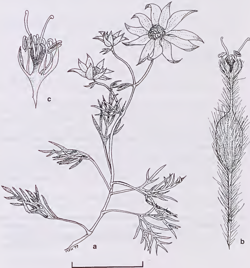
Fig. 1. Actinotus periculosus (from Henwood 511 ). a, foliose upper portion of branch with inflorescence; b, hermaphrodite flower; c, apex of gynoecial column with 3 sepals, 4 petals and 2 stamens removed (trichomes not illustrated). Scale bar: a = 100 mm; b = 5 mm; c = 4 mm.

Selected specimens: Queensland: Leichhardt: 'The Tombs', c. 143 km from Injune, Mt Moffatt section of Carnarvon National Park, Henwood 508 , 18 Oct 1998 (BRI, NSW, SYD); 15 km N of 'The Tombs' on Marlong creek, Mt Moffatt region of Carnarvon National Park, Henwood 511 , 19 Oct 1998 (BRI, NSW, SYD); Lookout at Lonesome National Park, Henwood 513 , 19 Oct 1998 (BRI, NSW, SYD); 'Balloon Cave', Carnarvon Gorge, Carnarvon National Park, Henwood 517 , 21 Oct 1998 (BRI, NSW, SYD); 'Spyglass Peak' Salvator Rosa section of Carnarvon National Park, Henwood 518 , 21 Oct 1998 (BRI, NSW, SYD); c. 100 m north of Get Down track, Robinson National Park, Henwood 520 , 23 Oct 1998 (BRI, NSW, SYD).