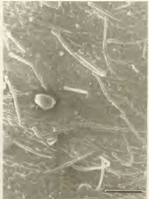
Fig 3. Scanning electron micrograph of the lower surface of leaflets in A. dipodorus (Nydegger 45253, MSB). Scale bar: 200 µm.