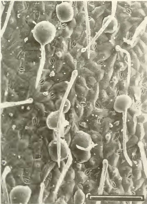
Fig 2. Scanning electron micrograph of the lower surface of leaflets in Ac. marashica (isotype: MSB). Scale bar: 200 µm.