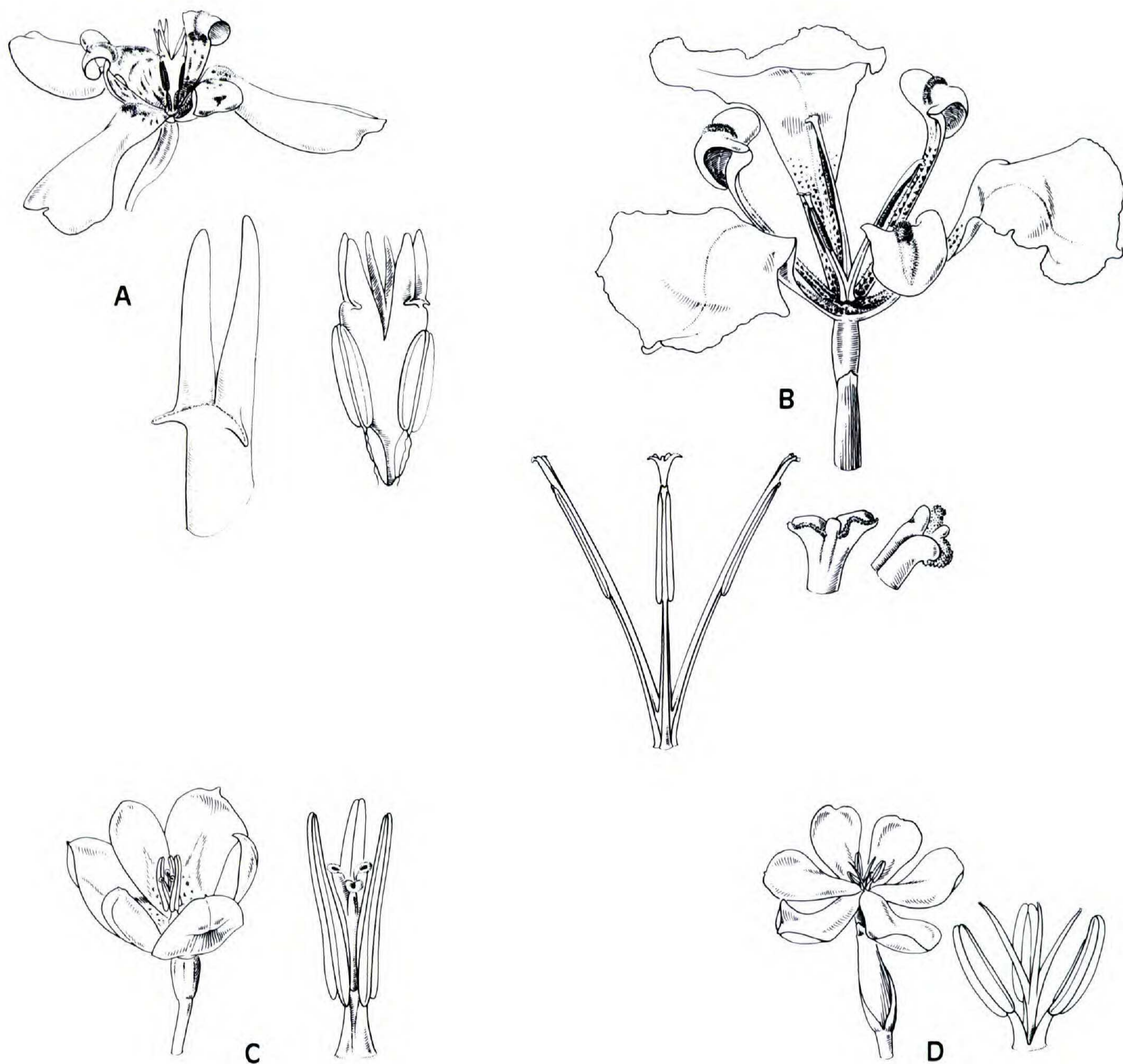
FIGURE 2. Flowers, style, and stamen detail and enlargement of style branch apex in selected Iridaceae.—A. Trimezia steyermarkii .—B. Onira unguiculata .—C. Gelasine elongata (= G. azurea ).—D. Eleutherine bulbosa . Habit and flowers full size; stamens and style \times 3 ; style branch apices much enlarged.

Tigridieae and acquired a rhizome and plane leaves secondarily. Both scenarios seem unlikely. In Iridaeae, a similar progression from the complex type of flower to the simple seems likely (Goldblatt, 1981, 1986, 1990) and the same pattern seems to have occurred in Cipura , a small genus of Tigridieae (Goldblatt & Henrich, 1987).