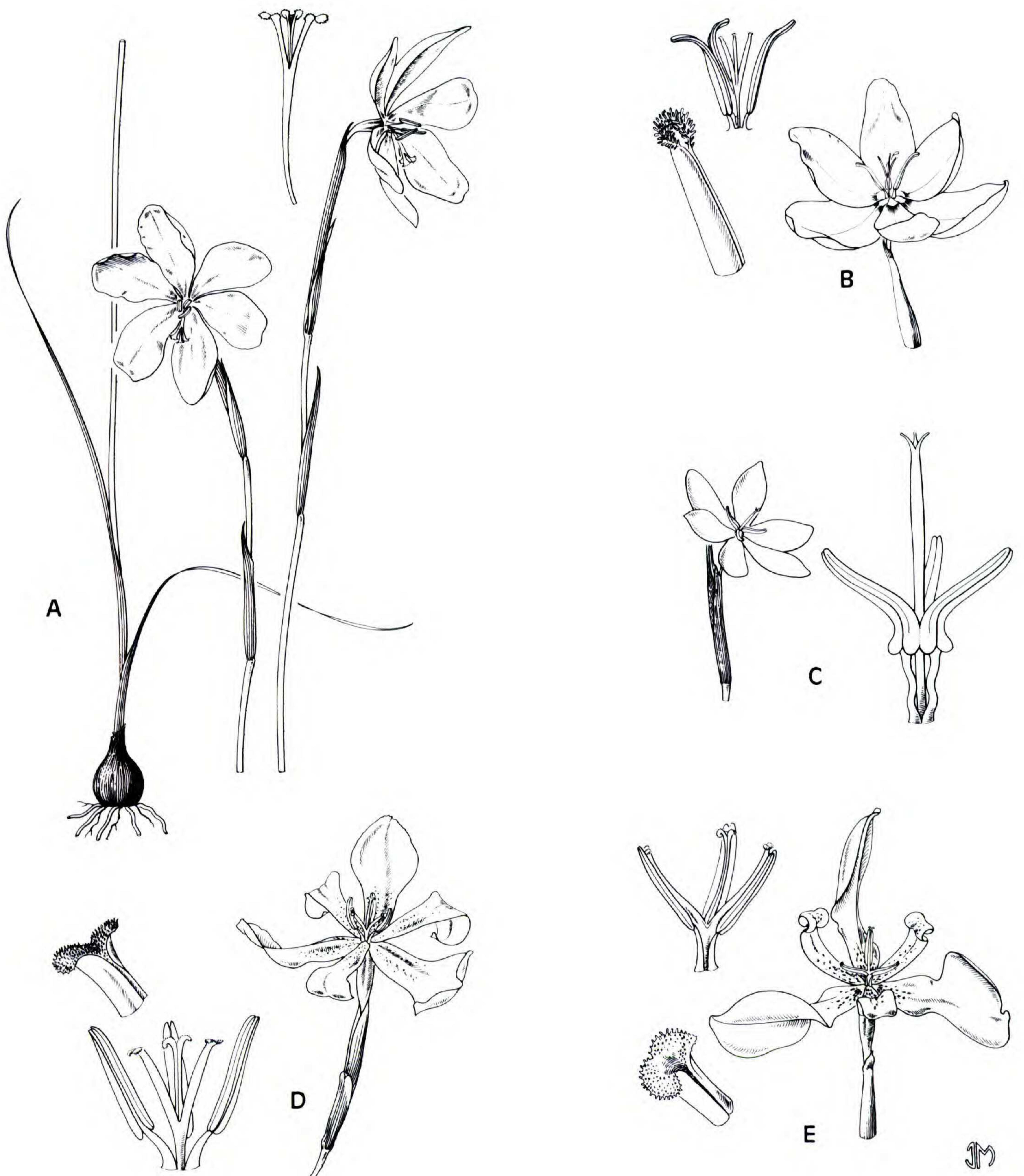
FIGURE 1. Flowers, style, and stamen detail and enlargement of style apex in species of Calydorea .—A. C. coelestina ( Salpingostylis ) (with habit).—B. Calydorea sp.—C. C. gardneri ( Itysa ).—D. C. pallens .—E. C. amabilis ( Catila ). Habit and flowers full size; stamens and style \times 3 ; style branch apices much enlarged.

vegetative morphology, and they have secund flowers with subequal inner and outer tepals lacking differentiation into a limb and claw. The filaments are free, and the long style divides above the level of the anthers into three short, slender branches (Fig. 1C), the structure of which closely resembles that in Calydorea . One peculiarity of the genus is that the bases of the anthers are coherent around