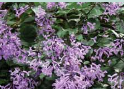
'Mona Lavender" Plectranthus

Characteristics: Sword-shaped leaves develop as the tall inflorescence of white, rose and brown flowers reaches full bloom in the late spring. The Nun's Orchid goes dormant in North Florida.