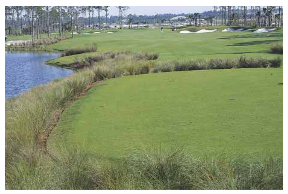
The Crown Colony Golf Club in Fort Myers used SeaIsle1 on its tees and fairways.

You must manage the salts before, during, and after managing the grass; otherwise, salt loading in the soil will overwhelm the tolerance of the grass and turf performance will decrease. Managing salt buildup in the soil is expensive and time consuming.