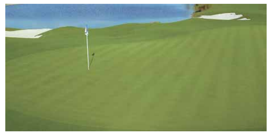
SeaDwarf, which was used on the Crown Colony Golf Club shown here, is another of the popular paspalum cultivars being used on golf courses.

as possible, depending on the various sources that can be blended. Install chemigation equipment on the irrigation system to have the flexibility to apply liquid fertilizers, amendments such as flowable lime or gypsum, wetting agents, or other chemicals.