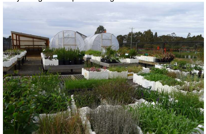
Melton Botanic Gardens Nursery area.