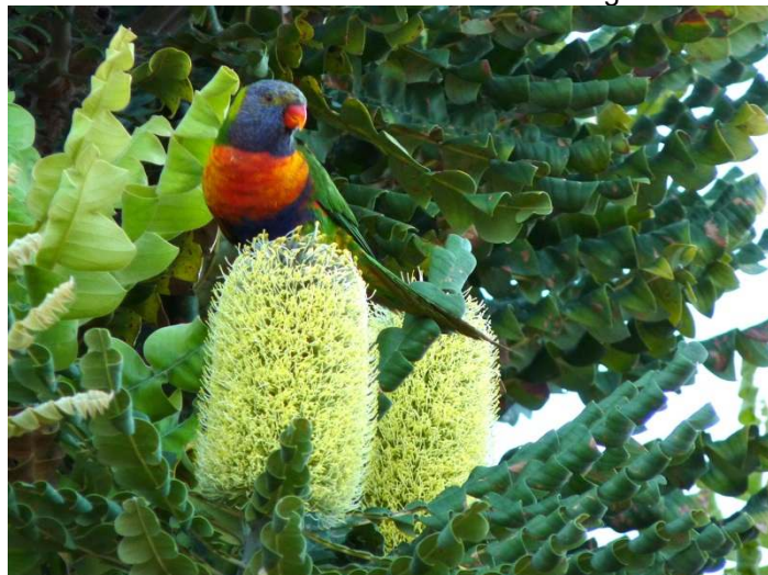
Banksia grandis and visitor