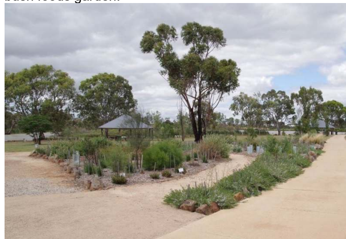
Koori student garden

Indigenous peoples' gardens - The MBGardens work closely with the local indigenous people and have established a Koori student garden and have planted a garden of indigenous plants that were used by aboriginal people. They have also constructed a ceremonial pit and a bush foods garden.