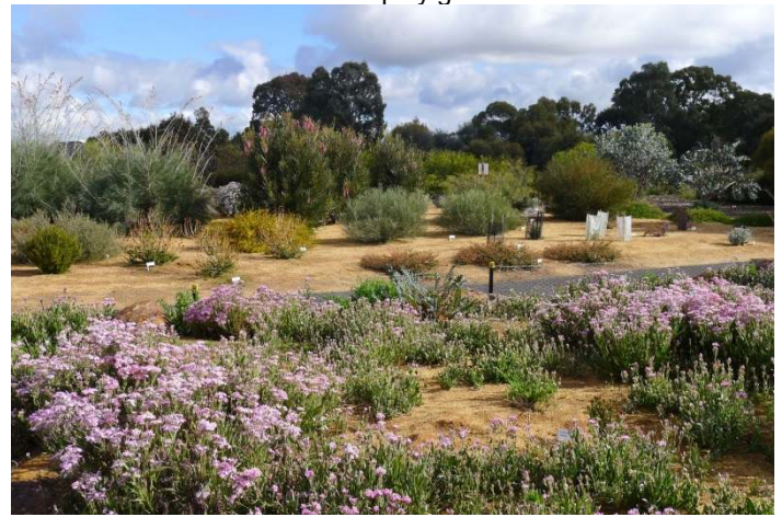
WA display garden

The MBGardens have also planted a Sensory Garden, South African Garden and a Mediterranean Garden.