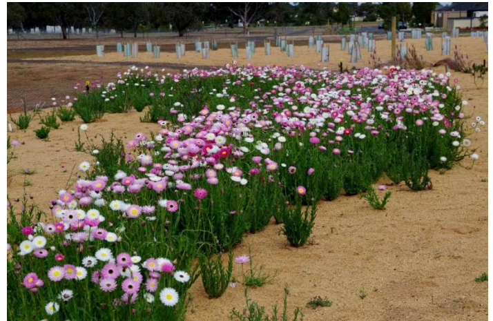
WA display garden