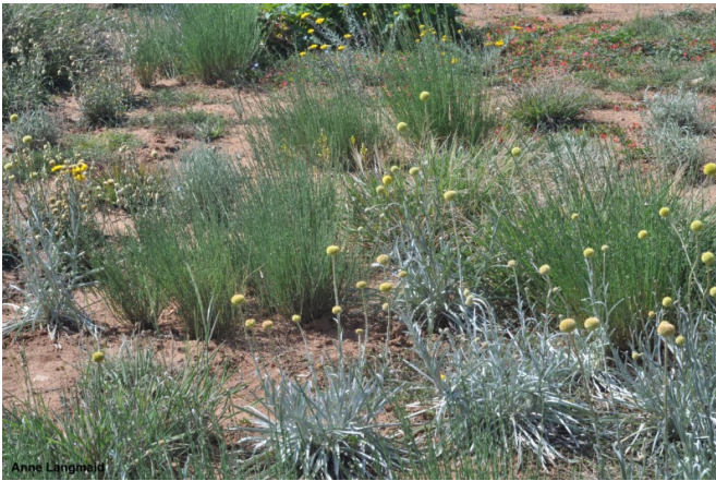
Aboriginal plant usage