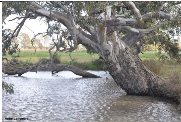
Melton Botanic Garden on Ryans Creek in Melton