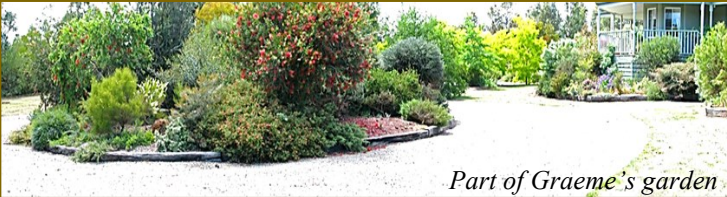
Part of Graeme's garden

Grevilleas are in the Proteaceae family as are Macadamias and you can see a similarity in the flower. Proteaceae are found from Africa to South America and even in Japan but not grevilleas. Many grevilleas grow at Graeme's but about 50 only like Queensland and New Caledonia - not cold old Gisborne! Grevilleas are found going in desert to snow and in forms from tiny shrubs to giant trees.