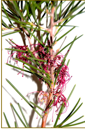
Darwinia meeboldii 'Cranbrook Bell' grows