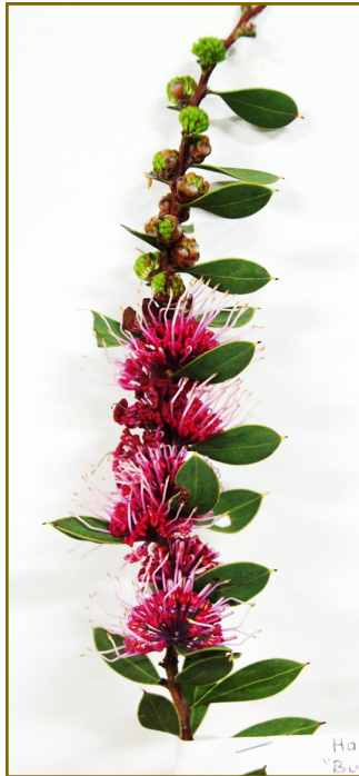
Thryptomene baeckeacea comes from WA but is very happy at Bev B's. It forms a dense bush (a bit

Hakea cerise pink 'Burrendong Beauty' is very popular and no wonder. Bev B's plant is very big - 1m tall by 3m wide- and very old and no longer flowering so well. Tony suggested annual pruning will improve flowering. Bev C said that since pruning hers it seems to be on steroids!