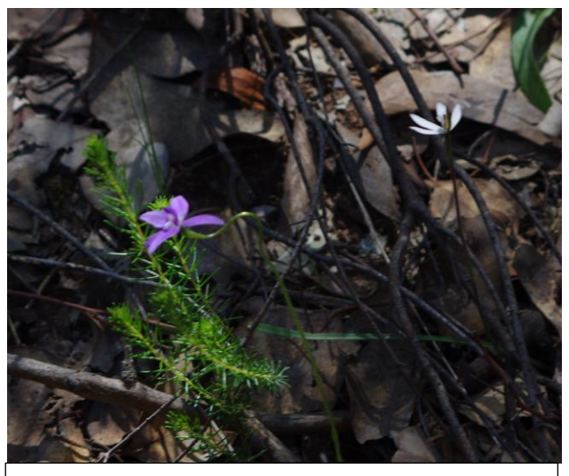
Wahlenbergia & Caladenia