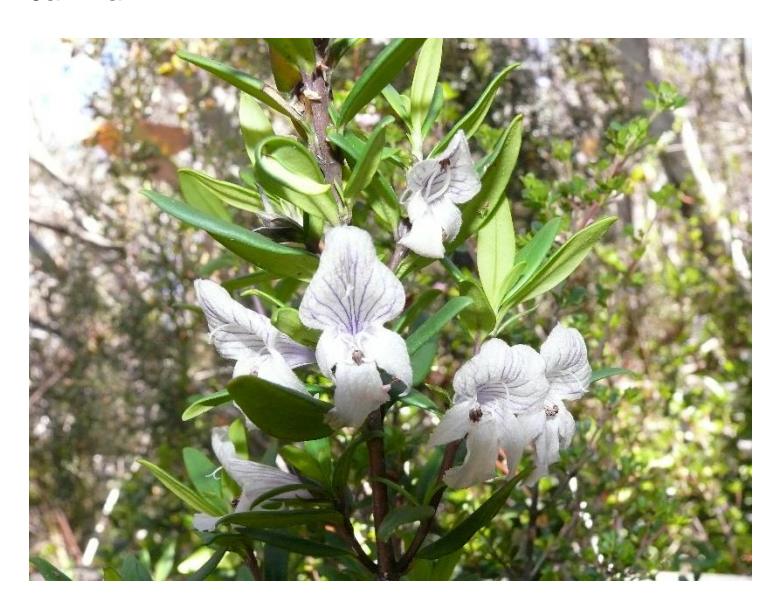
PROSTANTHERA MONTICOLA AT Mt Buffallo