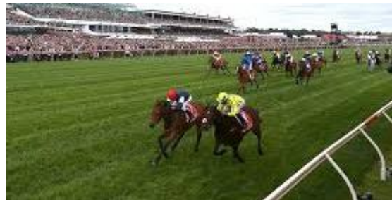
Some of the many uses for grasses!