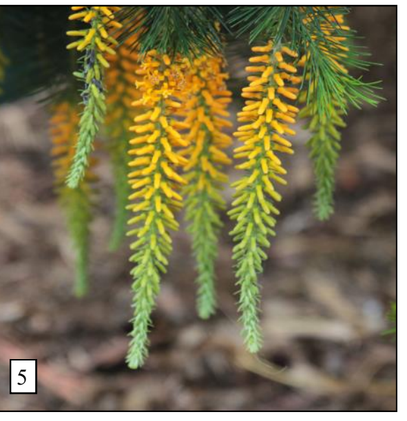
Photo 3: A weepy skirt of flowers on the pruned plant Photo 4: A close look Photo 5: Getting closer still