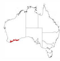
Acacia aemula subsp. aemula occurrence map. Occurrence map generated via Atlas of Living Australia ( https://www.ala.org.au ).