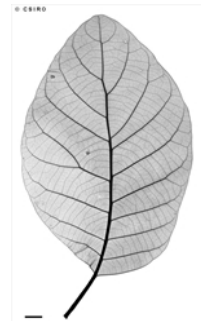
Scale bar 10mm.