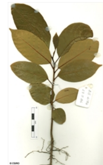
10th leaf stage. © CSIRO