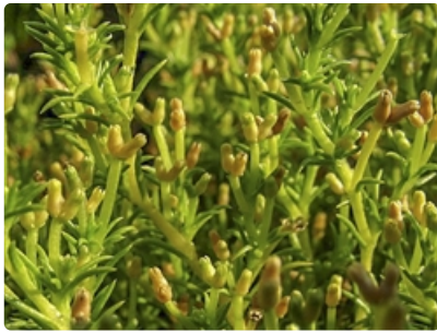
Flowering carpet.