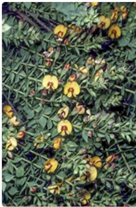
Flowering branches.