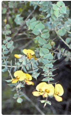
Flowering branches. Yaboro State Forest, west of Ulladulla