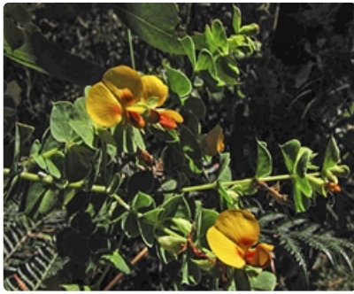
Flowering branches.