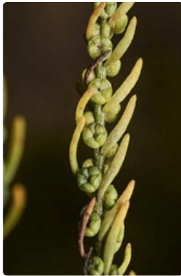
Stem with wingless seed cases. Carnarvon National Park, Qld