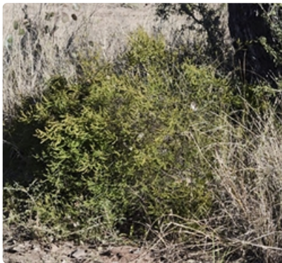
Shrub. Australian Plant Image Index, photographer Murray Fagg, Carnarvon National Park