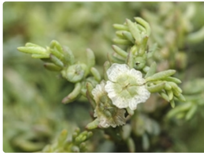
Winged seed case. Eurabba State Forest N of Terra