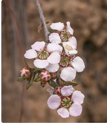
Flowering branch. Photographer Donald Hobern, Canberra, ACT