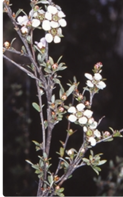
Flowering branch. Photographer Don Wood, Black Mountain, Canberra, ACT