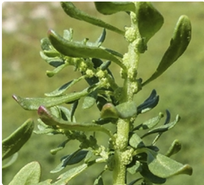
Flowering and seeding stem.