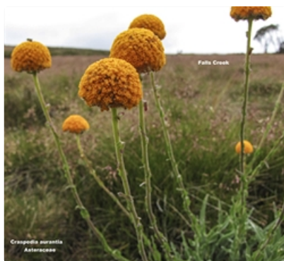
Flowering plants (var. aurantia).