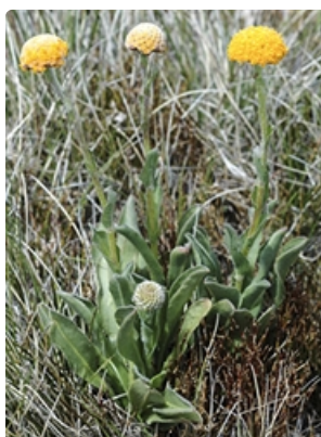
Flowering plants (var. aurantia ). Australian Plant Image Index, photographer Murray Fagg, Kosciuszko National Park