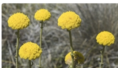
Flower heads (var. jamesii ). near Kiandra