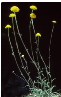
Flowering plants (var. jamesii ). Photographer Don Wood, Narradji National park, ACT