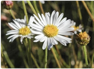
Flower heads. Australian Plant Image Index, photographer Murray Fagg, Kosciuszko National Park