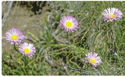
Flowering stems. Kosciuszko National Park