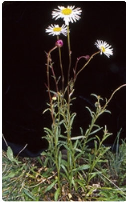
Flowering plant. Namadgi National Park, ACT