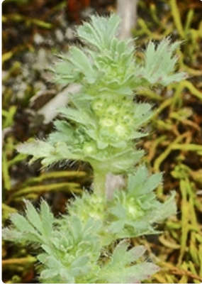
Flowering stem.