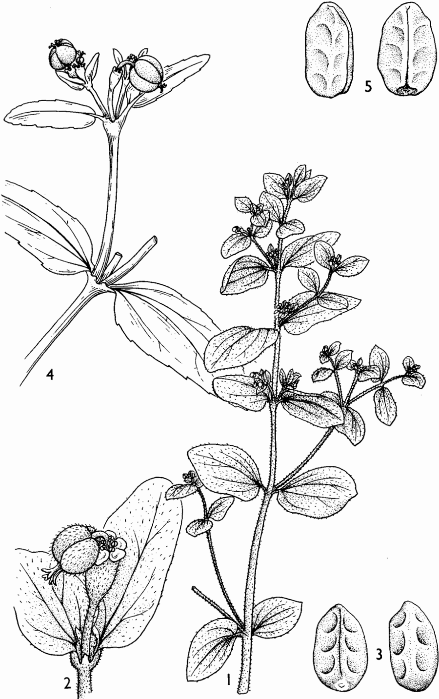
FIG. 77. EUPHORBIA INDICA — 1, habit, \times \frac{2}{5} ; 2, cyathium, \times 8 ; 3, seeds, \times 18 . E. HYSSOPIFOLIA — 4, flowering branch, \times 4 ; 5, seeds, \times 18 . 1, 3, from Tanner 2907; 2, from Tweedie 2253; 4, 5, from Harris 1093. Drawn by Christine Grey-Wilson.