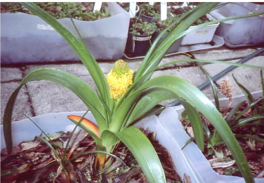
Fig. 27. B. rossii in cultivation.

Cartman, J. 1985: Growing New Zealand alpine plants. Reed Methuen Publishers Ltd. Auckland. Pp.39,40. Moore, L.B. 1964: The New Zealand Species of Bulbinella (Liliaceae). New Zealand Journal of Botany 2: 286-304.