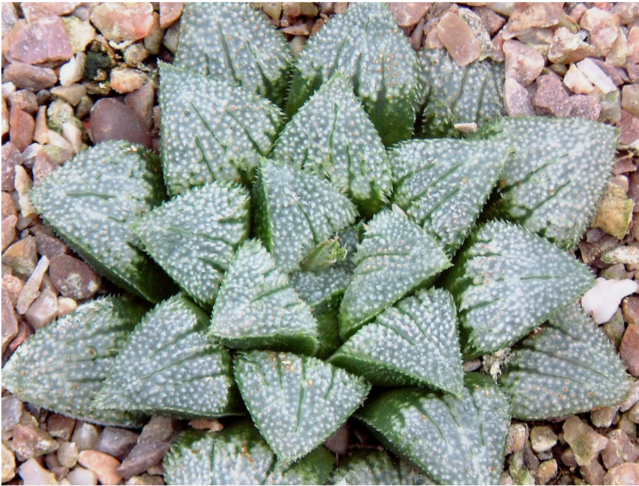
Fig. 28. Haworthia emelyae v. major x Haworthia bayeri

Haworthia bayeri . “Yumendono” cannot be regarded as cultivar name. Due to the occurrence of so many different forms of their parents, there is a wide range of cultivar variation. The plant depicted here is one of the most beautiful forms with plenty of papilla tubercles and deep greenish lines on windows. As expected, its growth is very slow and it seldom offsets. It can grow up to 10cm across. When in full sun, the colour of its body turns to reddish. In the hottest summer period, it simply stops growing and its contractile root draws the plant slightly into the soil. The plant here was obtained in 1996 from my friend Mr. T.K. Li in Hong Kong ex Japan.