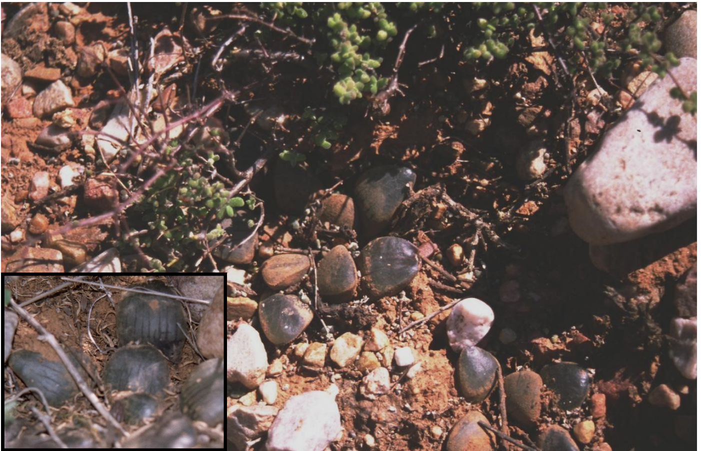
Fig. 17 (main picture) & Fig. 17a (inset). Haworthia springbokvlakensis

Fig. 17. Two plants, almost without surface markings. Fig. 17a neighbouring plant with surface markings. Only the retuse leaf ends are above the ground. The growing points are buried in sand and gravel. Springbokvlakte, Steytlerville.