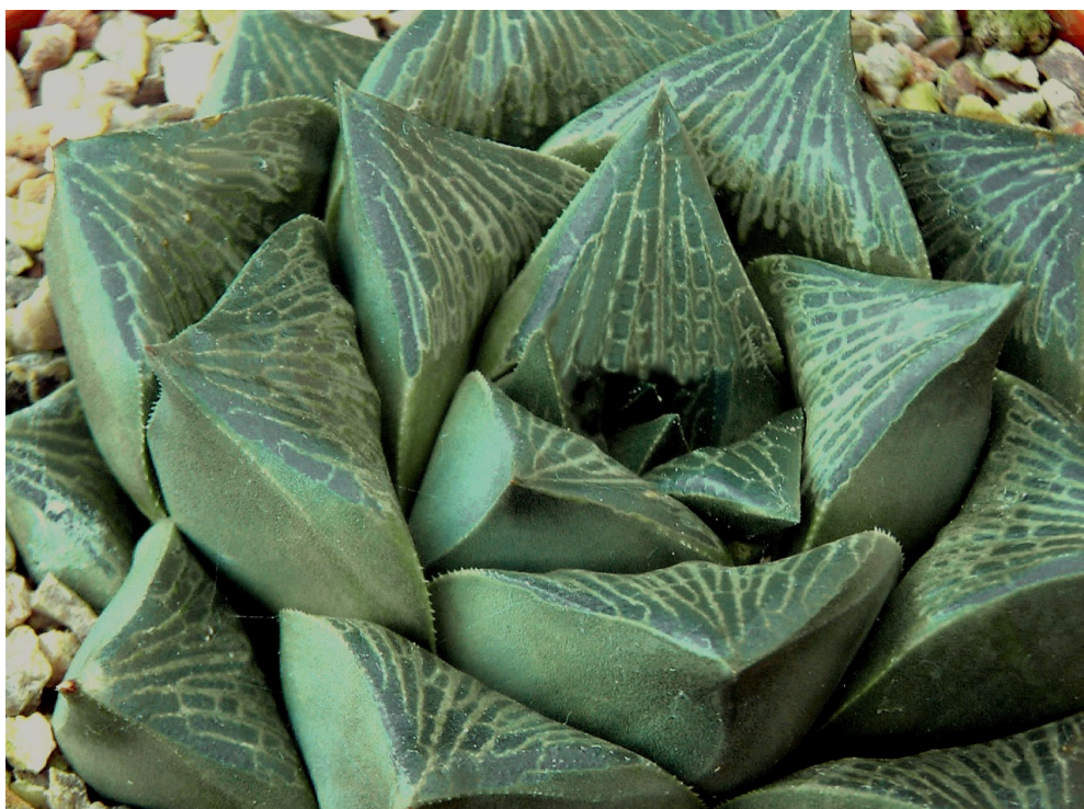
Fig. 31. Haworthia retusa x Haworthia springbokvlakensis [Ham 1152]