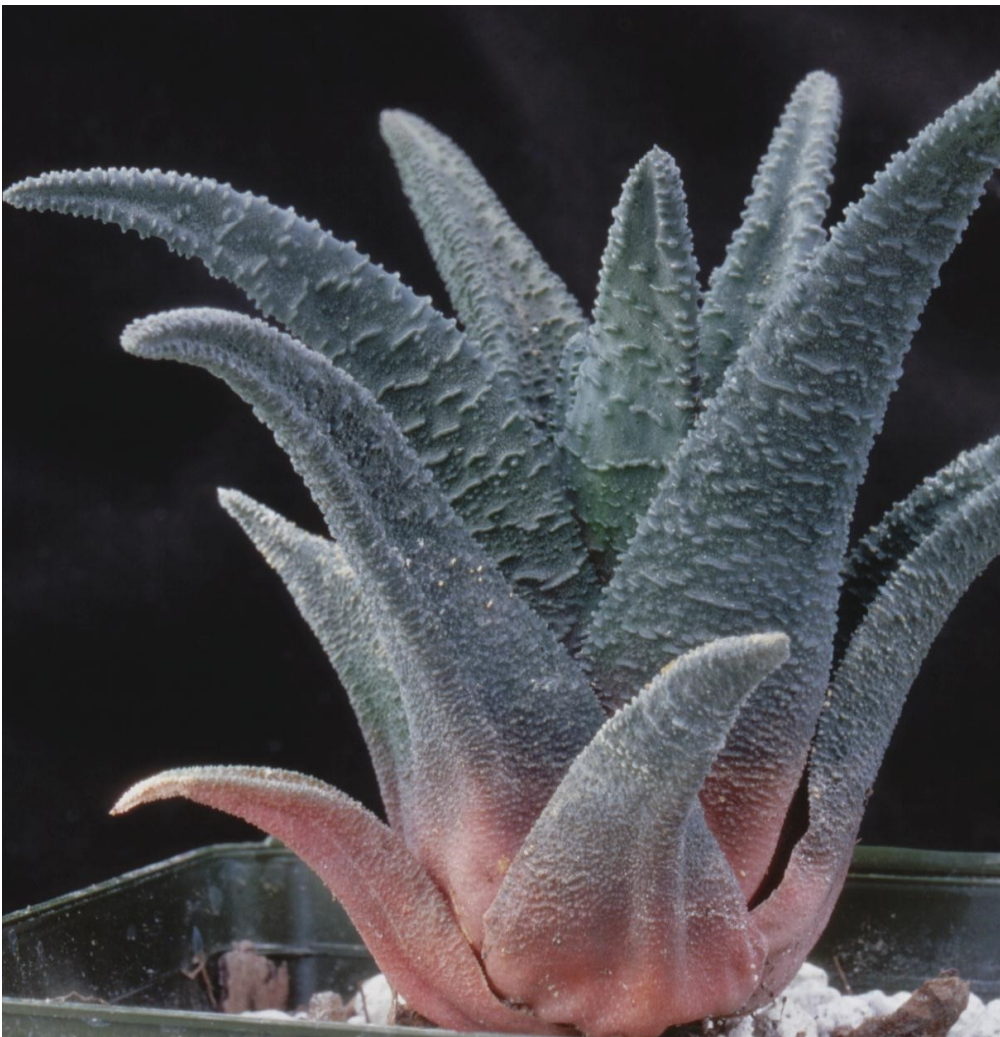
Fig. 16. Haworthia sordida Haw. var. sordida Collected about 60 km. ESE of Steytlerville, Eastern Cape

Haworthia springbokvlakensis ISI 2003 - 30 have been produced from the controlled pollination of habitat plants, also collected about 60 km ESE of Steytlerville, Eastern Cape, South Africa.