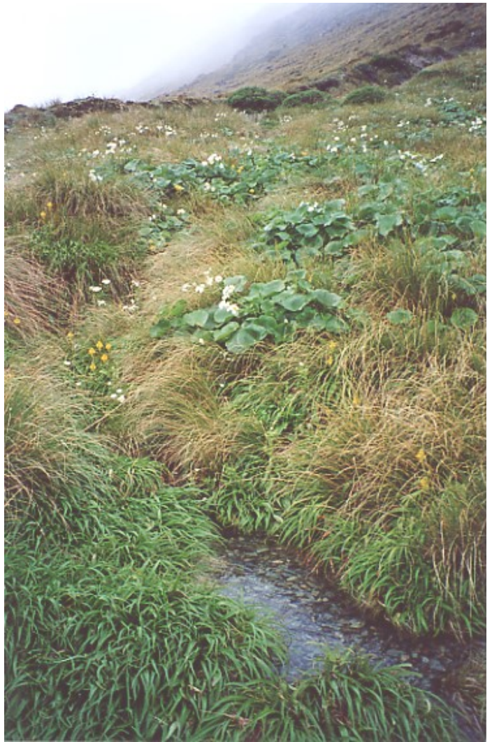
Fig. 22. Alpine meadow above Carroll Hut, B. gibbsii var. balanifera and Ranunculus lyallii in flower.

Southern Alps from Arthur's Pass south to Fiordland, in wet tussock grassland. Most racemes contain more than 50 flowers but ones with fewer flowers are seen. Inflorescences are prominently cone-shaped when the lowermost flowers are just open. Some populations experience "non-flowering" years, when only two or three plants produce flowers and seed out of a population of several hundred. Plants which flower without setting seed are also encountered.