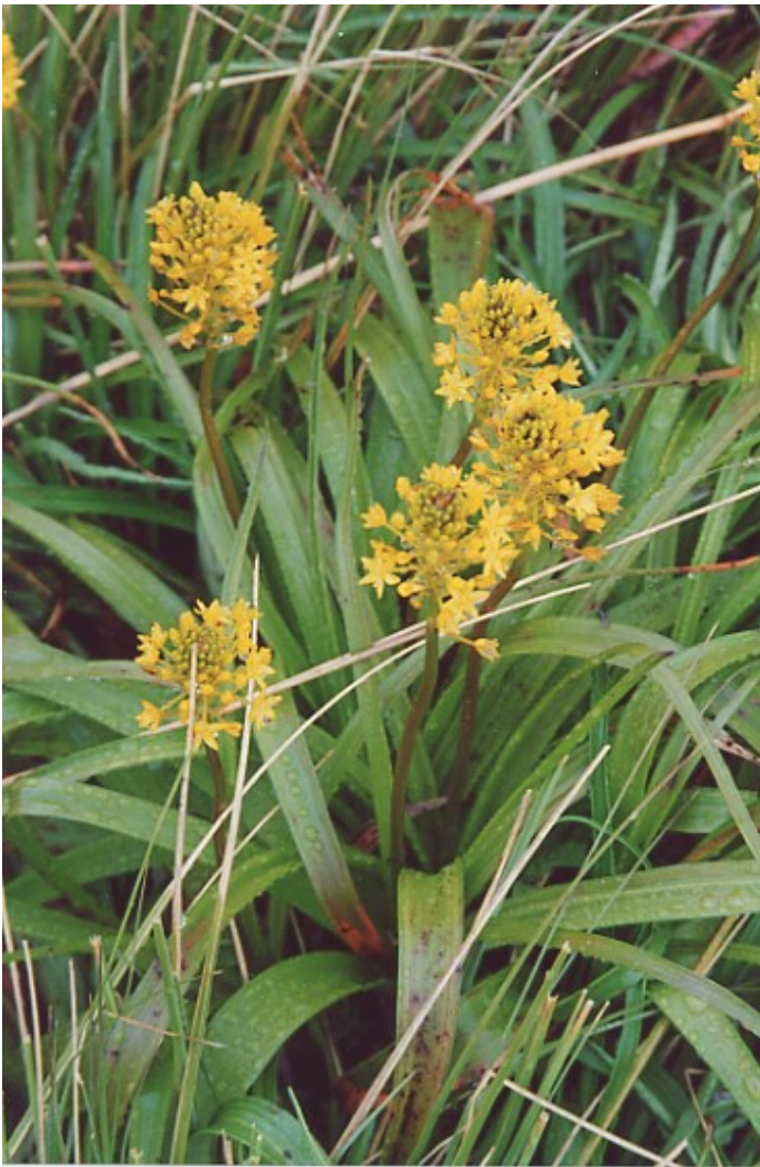
Fig. 21. B. gibbsii var. balanifera above Carroll Hut, Arthurs Pass Natinal Park, South Island.