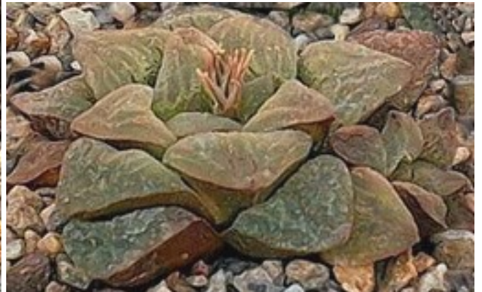
Fig. 7 (above) Haworthia 'Sandra' Fig. 8 (above right) Haworthia 'Frosty tips' Fig. 9 (right) H. emelyae ( correcta ) yellow variegated (ex Ekuma) Fig. 10 (right below) H. pygmaea creamy-white variegated (ex Ekuma) Fig. 11 (below right) Haworthia pygmaea (ex Ekuma) Fig. 12 (below) Haworthia "H 16"