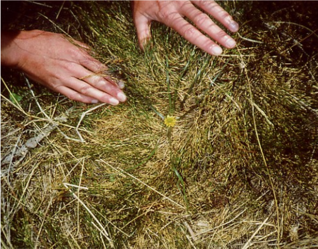
Fig. 26. B. talbotii . Goulard Downs, North-West Nelson, South Island.

Moore, L.B.; Edgar E. 1970: Flora of New Zealand volume II. A.R. Shearer Govt. Printer, Wellington. Pp. 21-25. Rigg, H.H. 1962: The pakihi bogs of Westport, New Zealand. Transactions of the Royal Society of New Zealand Botany I (7): 91-108. Webb, C.J.; Johnson, P.N.; Sykes, W.R. 1990: Flowering Plants of New Zealand. DSIR Botany, Christchurch.