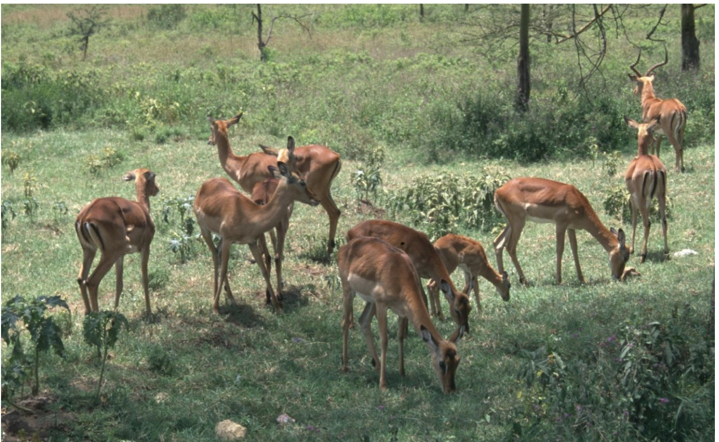
Fig. 18. Springbok

Fig. 17. Two plants, almost without surface markings. Fig. 17a neighbouring plant with surface markings. Only the retuse leaf ends are above the ground. The growing points are buried in sand and gravel. Springbokvlakte, Steytlerville.