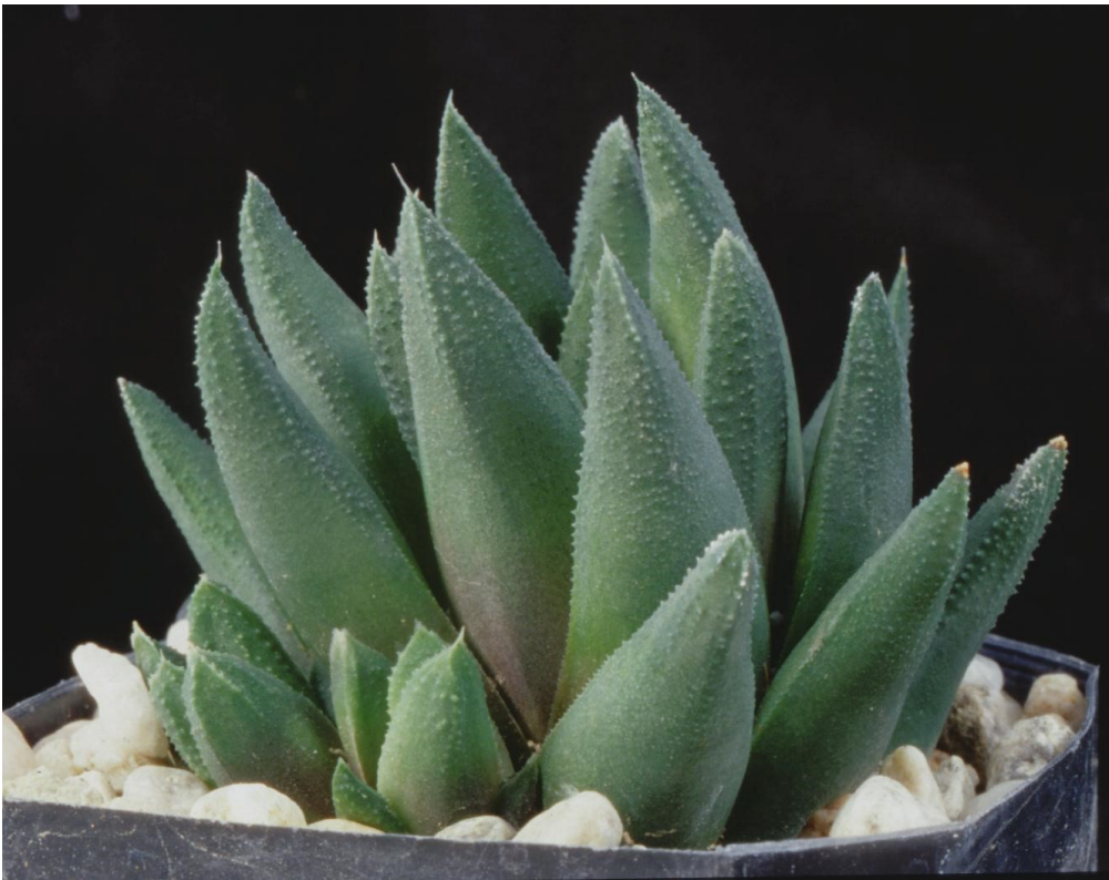
Fig. 15. Haworthia 'Grey Salt' ISI 2003-28