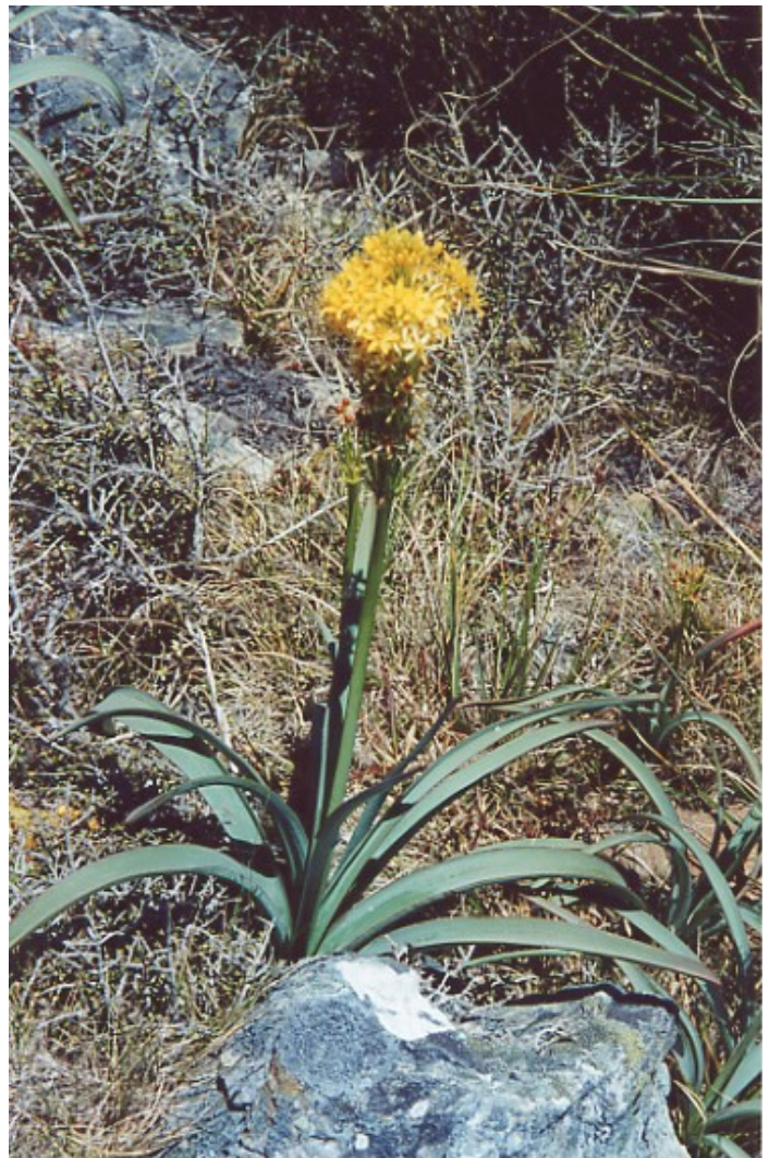
Fig. 20. B. hookeri on Mt. Stokes, Marlborough Sounds, South Island. Note glaucous sheen on leaves and peduncles.

B. gibbsii var. balanifera (figs. 21 & 22) shows a widely disjunct distribution pattern. This plant occurs in the North Island: Tararua Range and parts of the Ruahine Range; and in the South Island: in the mountains of the