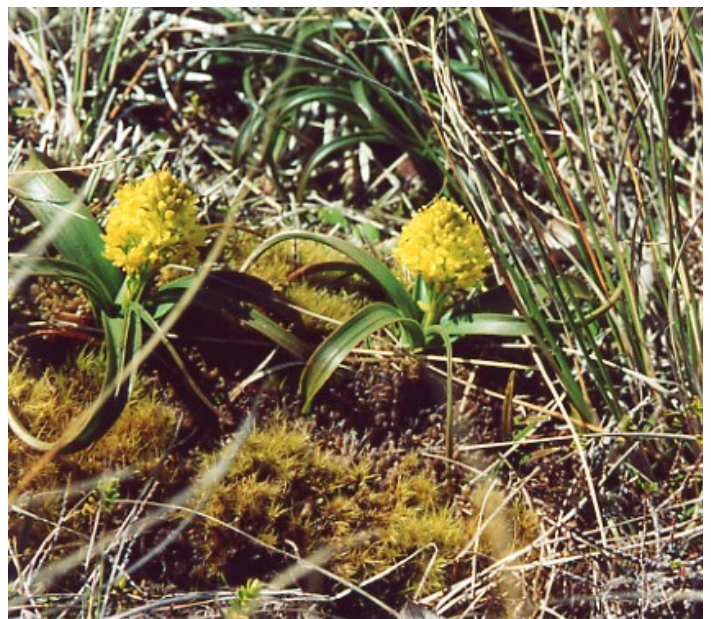
Fig. 23. B. gibbsii var. gibbsii on Mt. Allen, Stewart Island.

Otago and Southland, in damp tussock grassland, but is absent from the western mountains. This species is hermaphroditic. Flowering occurs during November and December (Moore and Edgar 1970). Generally plants of this species are smaller overall than those of B. hookeri ,