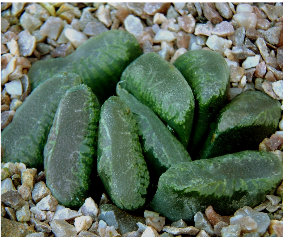
Fig. 29. Haworthia emelyae v. comptoniana x Haworthia truncata [Ham 1140]