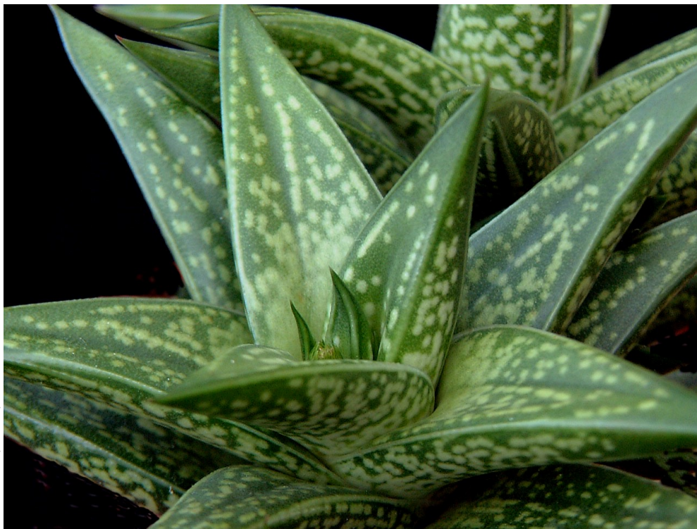
Fig. 30. x Gastroloba cv. [Ham 189]

The nothogenus name, x Gastroloba Cumm., was established in Bull. Afr. Succ. Pl. Soc. 9:36 in 1974. However, there are very few cultivars in cultivation. This is the only one I have ever come across. This rare cultivar was given to me by Dorothy Minors ex Brookside. From its general appearance, it cannot be mistaken other than as a hybrid between Gasteria and Astroloba . The variegation pattern on leaves and hard texture is characteristic of Gasteria . Whereas, the tough texture and extremely sharp leaf tips are typical of Astroloba . The leaves are arranged more or less in five columns. Each light-green rosette is around 10 cm tall and 7 cm across. It offsets readily. Inflorescences normally emerge in December and it flowers from February. Its flowers are essentially Astroloba -like. Propagation is normally by removing offsets. Its small size and well-marked foliage make it an attractive, choice plant in a collection.