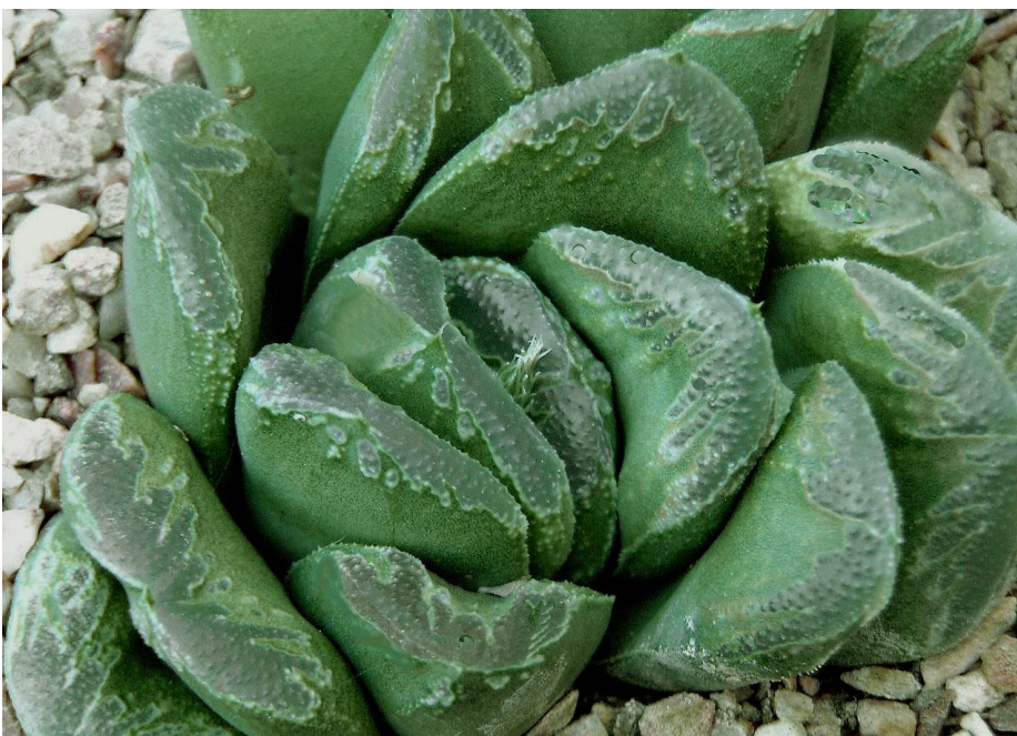
Fig. 14. Haworthia 'Rose Green' Hort. ex H.C.K.Mak n.cv.

resembling rose petals. The leaf tip is windowed and with a bristle of about 2 mm long. It stays green even in strong light. Leaves are rough and very thick, 1-1.5 cm. When grown in small pots, it offsets readily. In larger pots it grows bigger, but is slow to offset. This cultivar is widely grown and distributed and hence deserves a proper name. However, no cultivar name has been formally established for it. As "Green Rose" has long been used, it would be best to retain it as the cultivar name, but that name is not allowed in that form under Art. 17.13 of the 1995 ICNCP. I therefore name this cultivar 'Rose Green'.