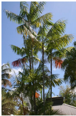
Euterpe oleracea at Hilo Zoo