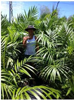
Euterpe oleracea Dwarf Acai