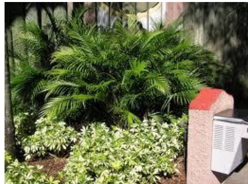
Chamaedorea cataractarum Cat Palm