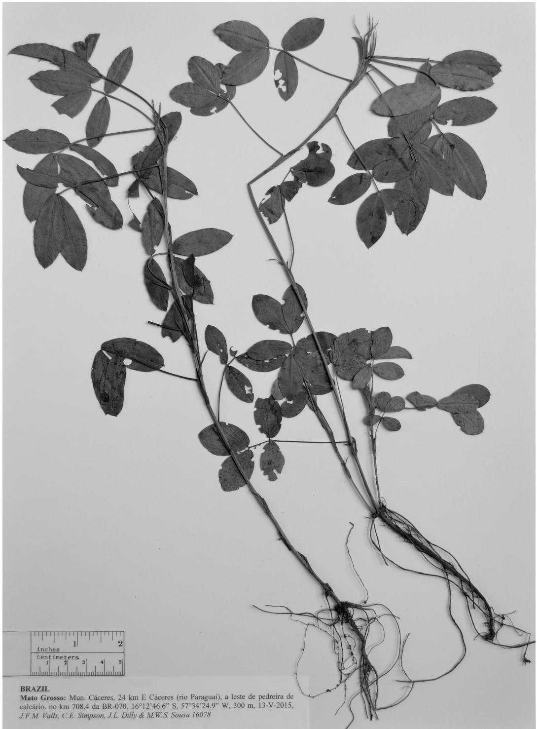
Fig. 1. Arachis jacobinensis Valls & C.E. Simpson. Plant habit, showing tall main axis (Type collection: Valls et al. 16078).