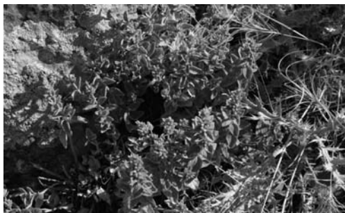
Figure 10. Cyclotrichium leucotrichum (Stapf ex Rech.f.) Leb.

Plant Part: Above-ground parts (Figure 10).