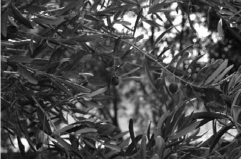
Figure 5. Olea europaea L.

Recommendation for use: The plant's leaves are boiled in water and are drunk a day twice against diabetes (Saruhan Filiz).