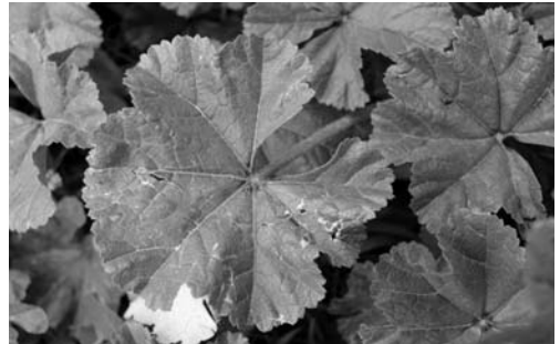
Figure 4. Malva neglecta Wallr.

Plant Parts: Leave, Stem, Root (Figure 4).