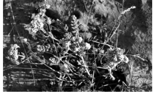
Figure 7. Teucrium polium L.

Plant Parts: Above-ground parts (Figure 7).