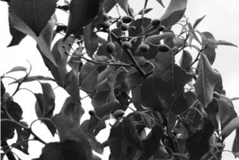
Figure 2. Cerasus mahaleb (L.) Miller var. mahaleb (L.) Miller