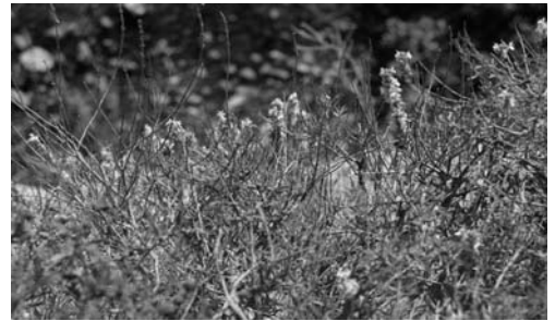
Figure 8. Thymbra sintenisii Bornm & Aznav subsp. sintenisii

Plant Part: Above-ground parts (Figure 8).