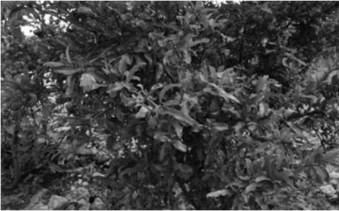
Figure 6. Punica granatum L.(Nar)

Recommendation for use: Pomegranate juice is drunk against diabetes (Cemil Aslaner).