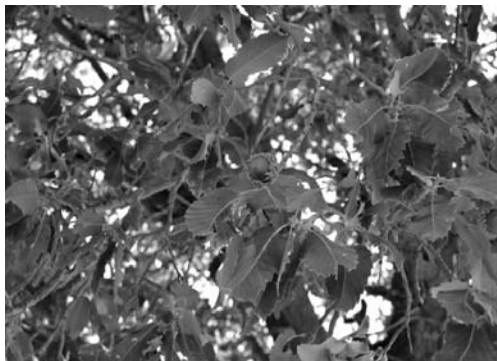
Figure 9. Quercus brantii Lindl.

Location: C8, Mardin; Savur, Bağyaka Köyü, Diyarbakır - Savur Yolu, 37° 33' 39.5" N, 42° 47' 49.4" E, 997 m, 02.09.2013, Ş.Arasan. Plant Part: Fruit-Coat (Figure 9).