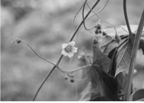
Figure 1. Bryonia multiflora Boiss. & Heldr.