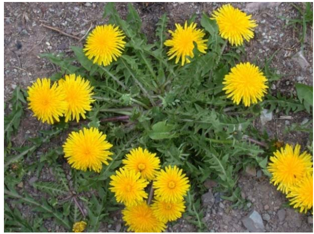
Taraxacum officinale F.H. Wigg.

officinale can be distinguished from native Taraxacum taxa in Alaska by the absence of horns on its involucre bracts and by its substantially larger flower heads. Native Taraxacum species are found primarily in undisturbed, herbaceous, alpine meadows.