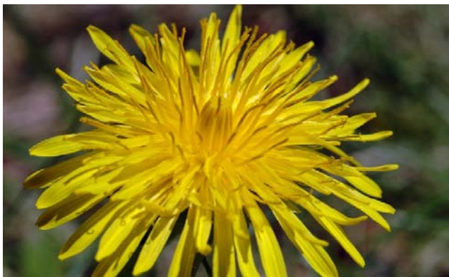
Flower head of Taraxacum officinale F.H. Wigg.

Common dandelion is a perennial herb that grows 5 to 51 cm tall from a branched stem base with a thick, deep taproot. Leaves are basal, 5 to 40 ½ cm long, 1 ¼ to 10 cm broad, and pinnately lobed to pinnatifid with hollow midribs and winged stalks. Flower heads rise from the basal leaves on hollow stalks and are composed of yellow ray florets. They are 2 ½ to 5 cm in diameter and surrounded by 2 rows of involucre bracts. The whole plant contains a white, milky juice (Welsh 1974).