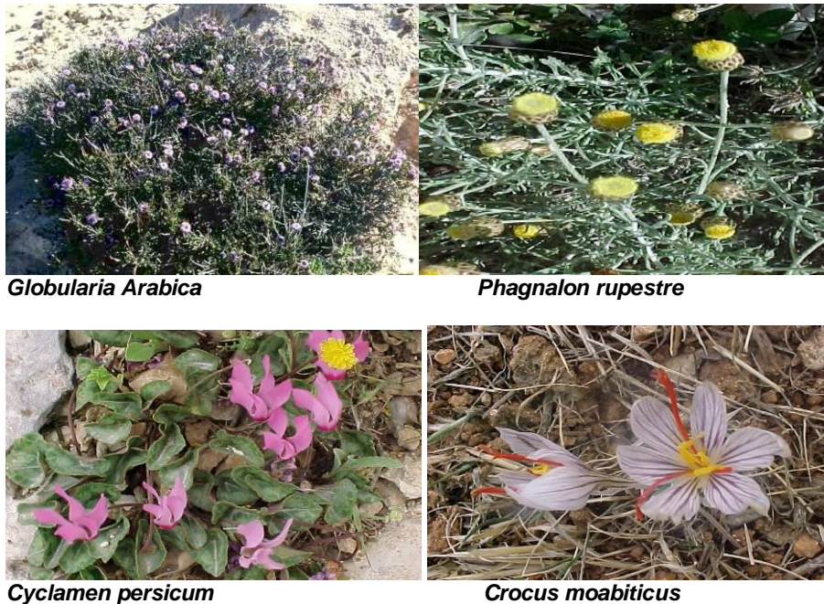
Figure 3. Some medicinal plant species in Tafila Province.