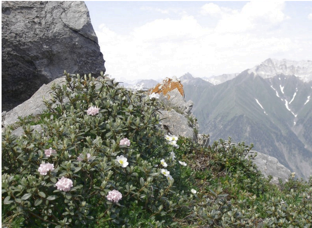
R. adamsii .