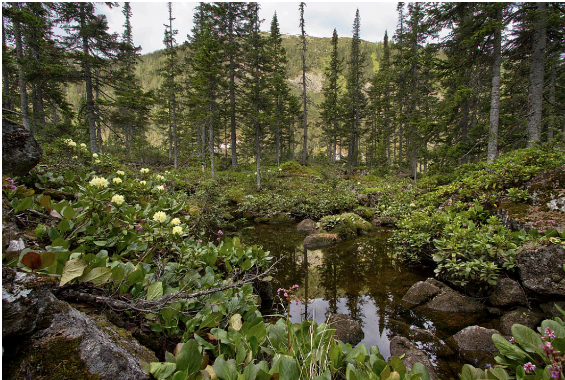
R. aureum with Siberian tea, Bergenia crassifolia, Baikal Reserve, Russia www.plantarium.ru/page/image/id/422140.html.

The rhodo' is used as a tea for various disorders as is R. aureum (old syn. was R. chrysanthum ), which Steller described on several occasions. He tried it out on some ?-Musk deer that subsequently fell into a convulsive stupor for several hours.