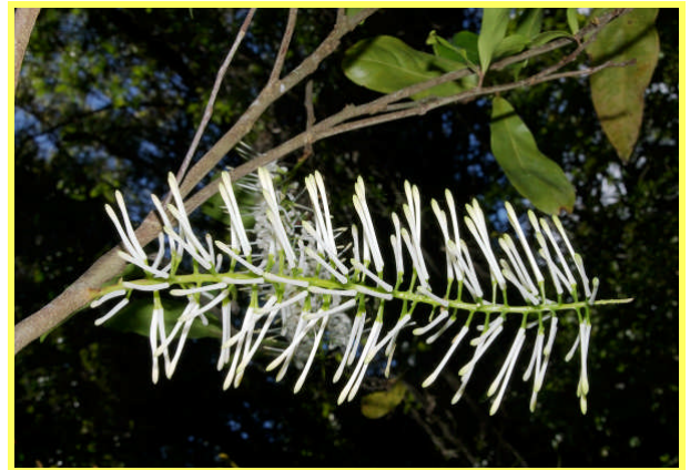
Megahertzia amplexicaulis - From Roaring Meg Creek