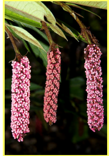
Noahdendron nicholasii - From Noah Creek