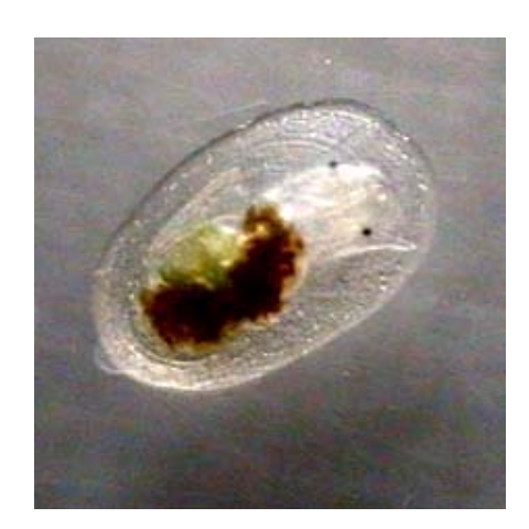
Figure 2. Young translucent Ferrissia fragilis from ornamental aquarium