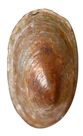
Figure 1. Ferrissia fragilis (Tryon 1863)

In the Dniestr Delta F. fragilis was found in flowing waters, mostly on stone substrates and on reed ( Phragmites australis ).