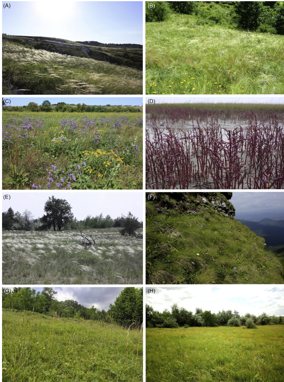
Fig. 2 Grassland types of the region: (A) steppe grassland on chalk outcrops, Dvorichansky National Nature park, Kharkiv oblast, Ukraine; (B) steppe grassland patch in a forest-steppe of Northern Hungary; (C) inland saline grassland, Oril river floodplain, Poltava oblast, Ukraine; (D) coastal halophyte vegetation, Dzharylhach Island, Kherson oblast, Ukraine; (E) sand steppe, Oleshkivsky Sands National Nature park, Kherson oblast, Ukraine; (F) rocky grassland, Svydovets ridge, Carpathian Mountains, Ukraine; (G) dry secondary grassland on limestone, Bükk Mountains, Hungary; (H) mesic secondary grassland, Lower Dnieper floodplain, Kherson oblast, Ukraine.