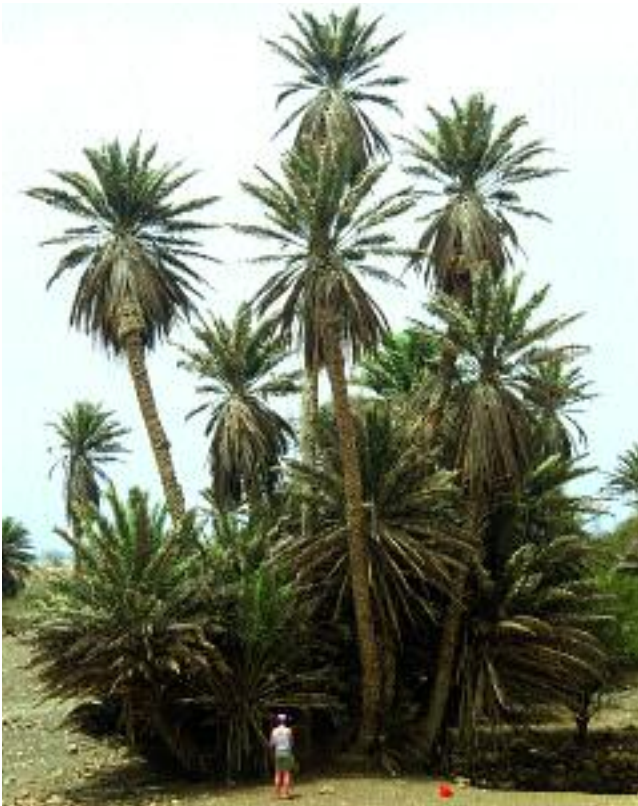
1. Phoenix at Algodeiro, Sal; one of Chevalier's syntype localities for Phoenix atlantica . This female specimen had more than ten mature stems and reached a height of over 20 m. Sally Henderson provides scale.

Herbarium, Royal Botanic Gardens Kew, Richmond, Surrey TW9 3AE, UK