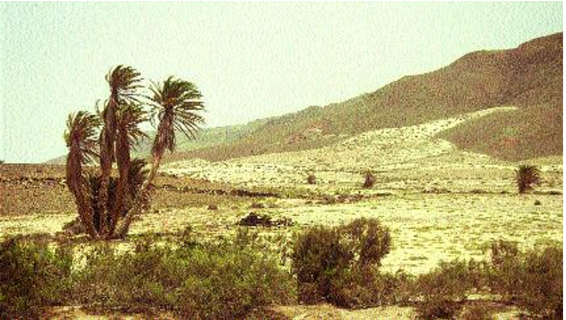
8. A clustering adult Phoenix growing in the interior of Boavista. Other individuals established in the dry stream-beds, can be seen in the background. Tamarix canariensis grows the foreground.

more reminiscent of 19 th century industrial Britain than of anything we had seen so far on the other islands. The salinās themselves are set within the adjacent crater, reached by a tunnel carved through the crater wall. The tunnel is found by following the cables and wooden pylons of the old tramway that was used at the peak of the production to transport salt from the crater to the port at the village. Today, one passes through the mountain to the salinās to find a surprisingly silent and beautiful place, with regularly-spaced rectangular ponds of pink, blue and white. The rusting machinery and rotting buildings remain, the pulleys and tram-carts still visible, as if the whole industry was stopped short and abandoned suddenly before the end of a day's work.