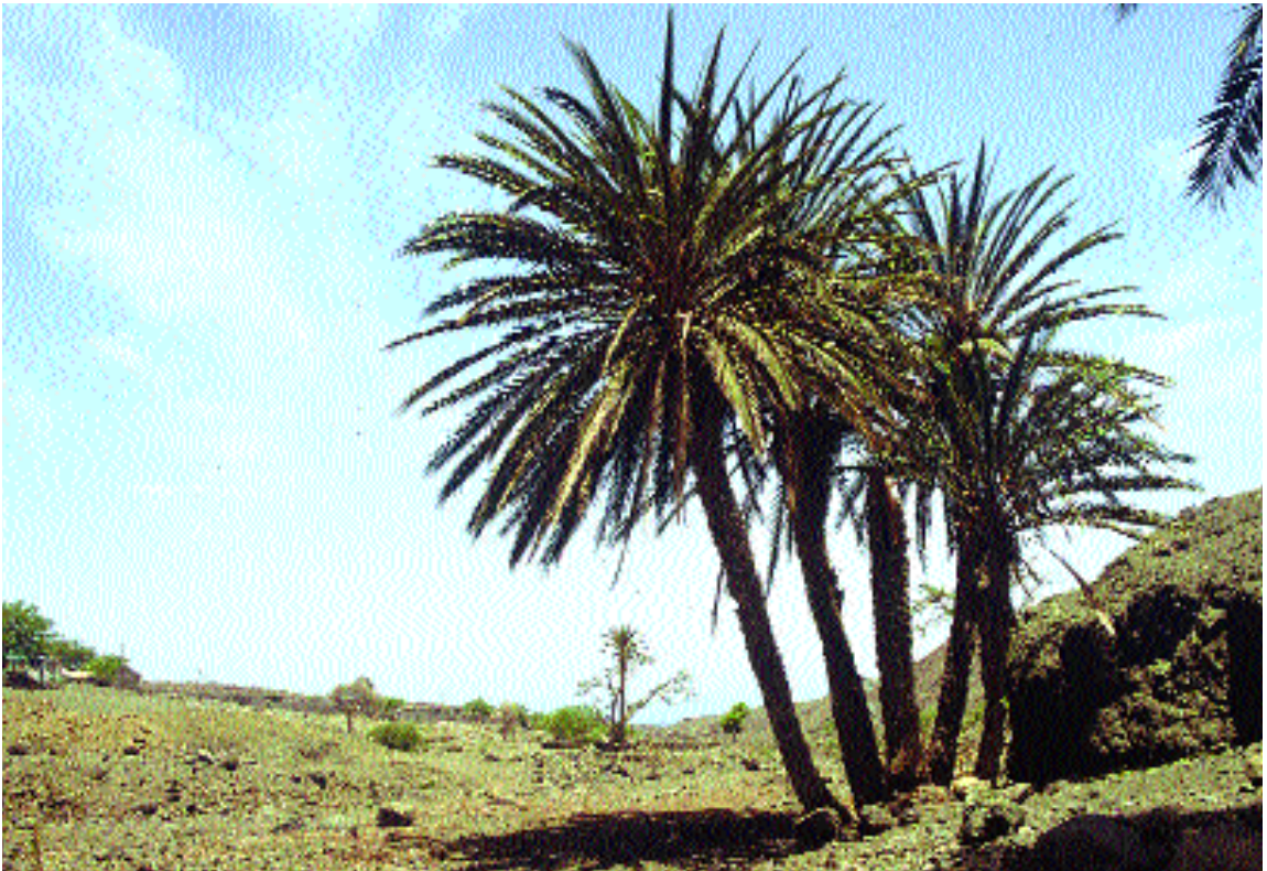
3 (top). Ribeira São Martinho Grande looking south, one of Chevalier's syntype localities for Phoenix atlantica , Santiago. A very similar photograph, taken by Chevalier in 1935 (looking north), indicates that little has changed since then in terms of landscape and vegetation (see Fig. 5). 4 (bottom). Phoenix in Ribeira São Martinho Grande, Santiago. This clustering male specimen had at least seven mature stems, which reached ca. 9 m.