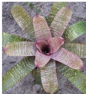
Vr. 'Maroochy Lolly Pink' unreg.