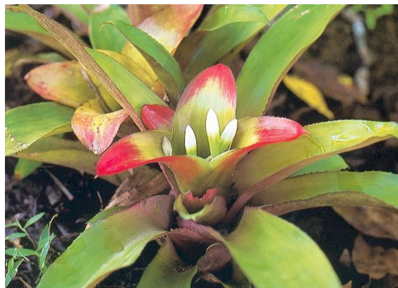
Nid. longiflorum Leme 782

▲ Showing flowers in central uniutriculate vase/cup only ▲ Originally as Nid. innocentii var. wittmackianum now as Nid. longiflorum .