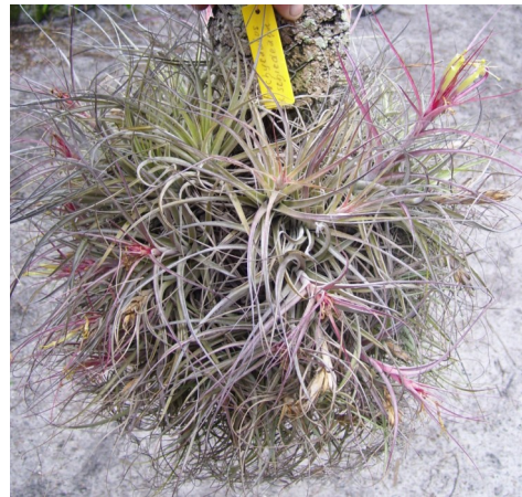
Tillandsia 'Laurie' brachycaulos x schiedeana