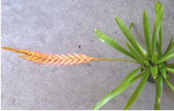
Plant acquired as Vr. biguassuensis , possibly Vr. taritubensis ??