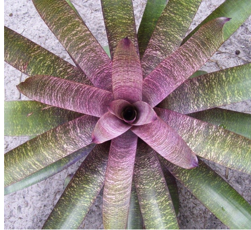
Vriesea 'Maroochy Mauve Star' unreg.