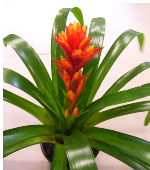
Guzmania unknown ??