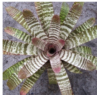
Vr. 'Maroochy Arctic Star' unreg.