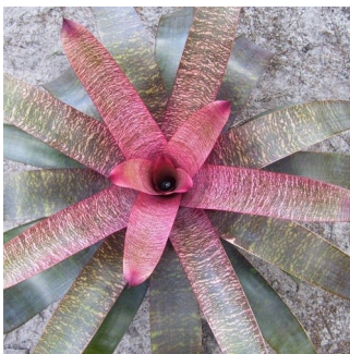
Vr. 'Maroochy Pink Pleasure' unreg.