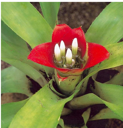
Nid. longiflorum Leme 1776

What does intrigue me is that Leme in 2000 did not mention the error in Smith & Downs 1979.