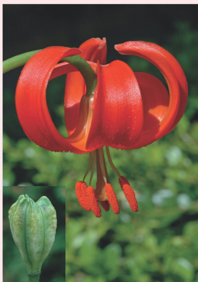
The Goulandris Natural History Museum

A new book on the flora of Greece has been recently published. It presents the bulb flora on the territory of the regional unit of Ilia located in NW Peloponnese, after a detailed survey. The bulbous plants have