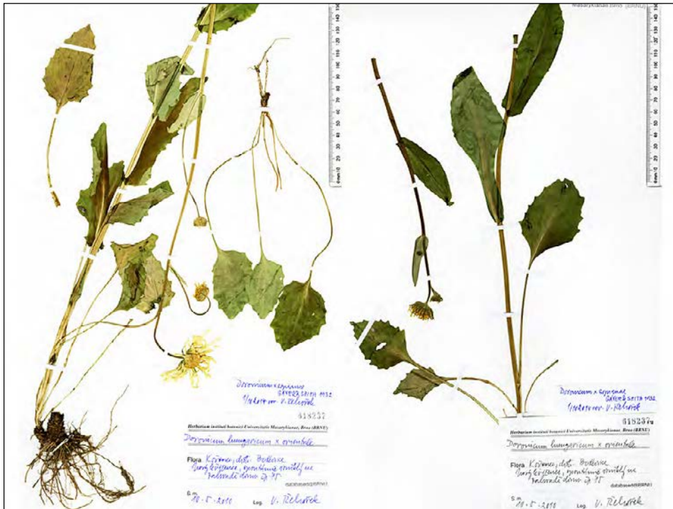
Fig. 1. Herbarium specimens of D. xosopiana collected in the garden.