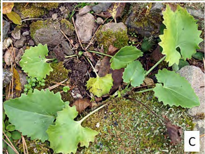
Fig. 2. Basal leaves of D. hungaricum (A), D. xosopiana (B), and D. orientale (C).