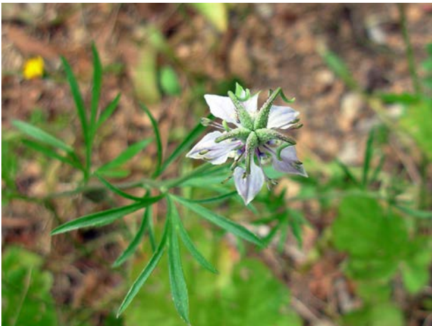
Fig. 6. Nigella doerfleri .

Finally, we would draw attention to a species wrongly reported for Astypalea: Bongardia chrysogonum . In actual fact, d'Urville found Leontice leontopetalum on Astypalea. Later Boissier (1867: 99) inex-