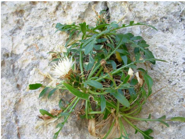
Fig. 3. Centaurea raphanina subsp. mixta .

Staehelina fruticosa (L.) L. A southeast Greek endemic and obligated chasmophytic species, with remarkable woodiness, growing on limestone cliffs with strong