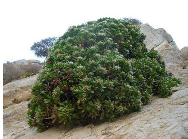
Fig. 4. Staehelina fruticosa .

Dianthus fruticosus L. subsp. amorginus Runemark. One of the allopatric species living in the Aegean area, it is an obligated chasmophytic species with remarkable woodiness, growing on limestone cliffs.