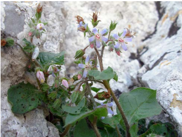
Fig. 2. Symphytum creticum .