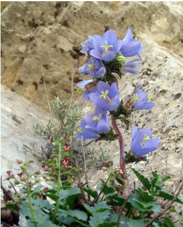
Fig. 5. Campanula laciniata .

Nigella doerfleri Vierh. An endemic species with a range restricted to Kik and KK (Fig. 6). It occurs on Astypalea and was also recently reported on Tilos (Dodecanese), expanding its distribution area in the EAe (Strid 2016).