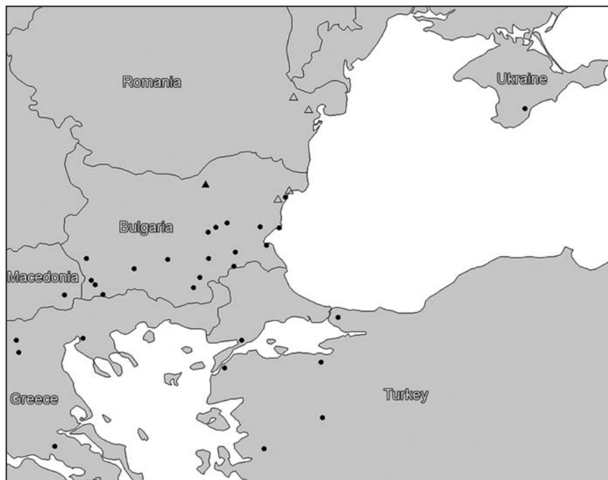
Fig. 3. Distribution of B. uechtritizianum (▲ – type locality; △ – existing erroneously determined as other species) and B. asperuloides (●).

for dispersal and to fragmentation of natural habitats resulting from the old, long-lasting human presence in this plain-and-hilly part of Europe.