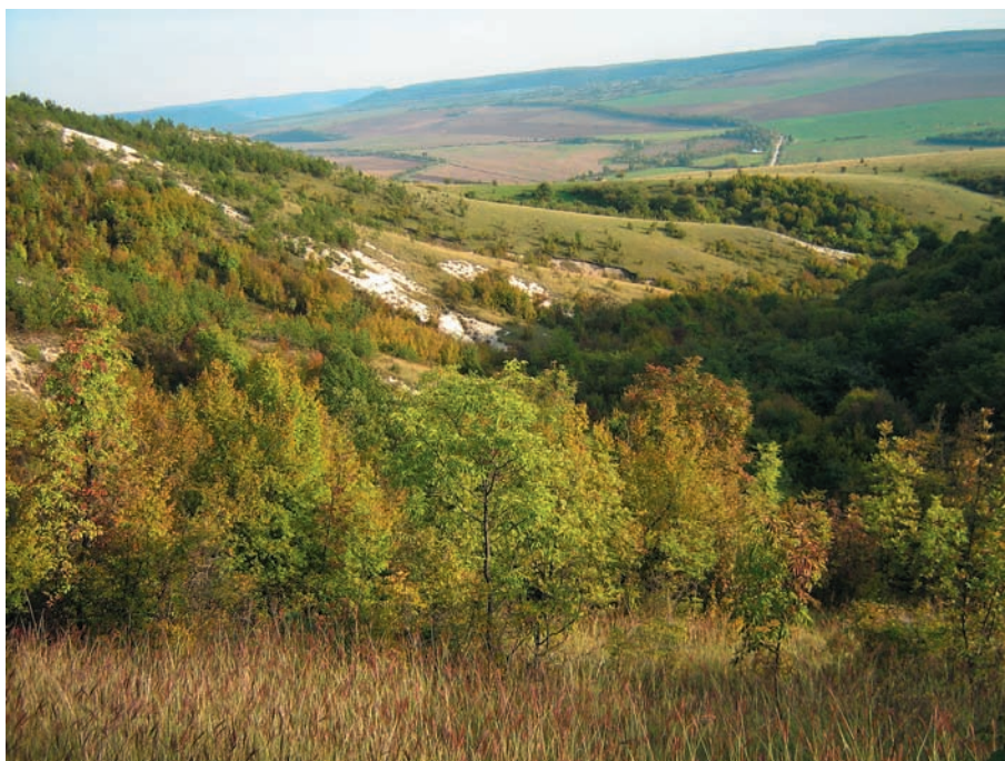
Fig. 4. Habitat of B. uechtritizianum (near Katselovo village).

bush communities that comprise mainly xerophilous species were also found: Fraxinus ornus L., Cornus mas L., Crataegus monogyna Jacq., Ligustrum vulgare L., Pyrus pyraster Burgsd., Rhamnus saxatilis Jacq., Cleistogenes serotina (L.) Keng, Carex halleriana Asso., Calamintha nepeta (L.) Savi, Satureja coerulea