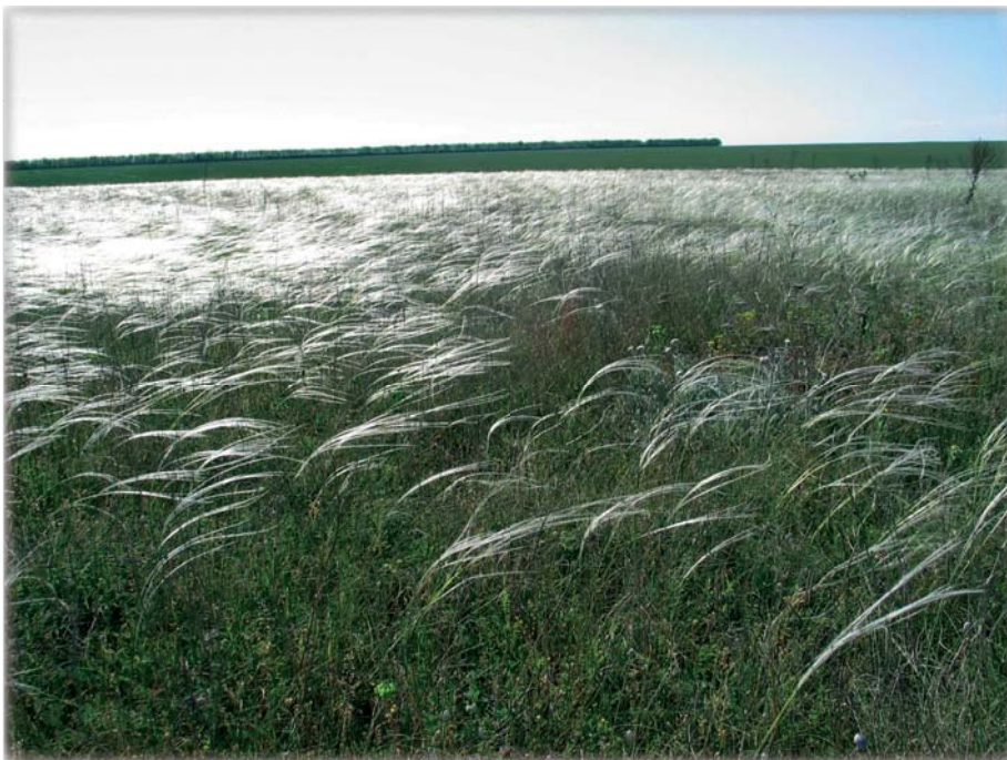
Fig. 3. S. ucrainica dominated the vegetation in May 2007.

The vegetation was documented from two sample plots (Table 1). Both relevés were made on level terrain, at 50 m altitude. The total projection cover of the vegetation was 90%. The cover of stones and pebbles on the soil surface was under 5%. With more than 50 species (70 species were identified altogether) found per relevé, the community had remarkable floristic diversity. All species found were herbs, with strong prevalence of perennials (66%).