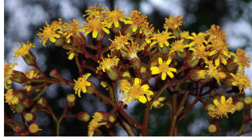
FIG. 3. Roldana gilgii . Tribe: Senecioneae. Known only from the western Guatemalan highlands and Chiapas, Mexico. Plant 0.25 normal size.

In addition to being the most species-rich plant family in the montane regions of Latin America, the Asteraceae represents one of the most conspicuous floral elements (Nash and Williams, 1976; Villaseñor et al. 1998; Strother, 1999; Kessler, 2002). For example, in the Bolivian Andes, the Asteraceae, while found to be distributed at all elevations, has its highest values of species