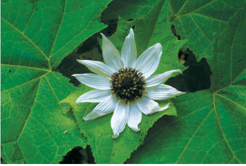
FIG. 2. Rojasiyanthe superba . Tribe: Heliantheae. Known only from three departments in the western Guatemalan highlands and Chiapas, Mexico. Head 0.25 normal size.

Sancho, 2004). Recently, the Asteraceae has been divided into 17 tribes (Bremer, 1994); current phylogenetic evidence suggests that as many as 31 tribes may be recognized (Panero and Funk, 2002). Growth forms within the Asteraceae include annual, biennial, and perennial herbs, vines, shrubs, trees, lianas, and a small number of epiphytes. Pollen evidence indicates that the Asteraceae has a long evolutionary history in Central America with the family showing an explosion in diversity during the Miocene (Raven and Axelrod, 1974). In addition, topography (Kessler, 2002), geographic isolation, and optimal growth conditions led to the evolution of a particularly large number of Asteraceae in the montane regions of Guatemala and Mexico. In Mexico, the Asteraceae has been used as a target group for conservation based on the high number of endemic taxa found in that country, especially in the states of Chiapas and Oaxaca (Villaseñor et al., 1998).