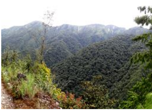
High mountain ridge