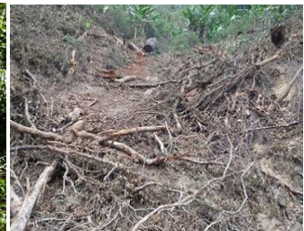
Timber and firewood harvesting