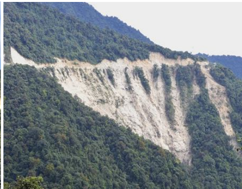
Vegetation destroyed by road construction at Nechiphu