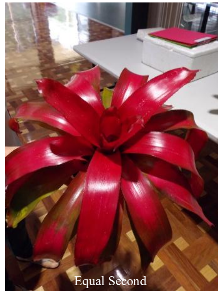
Equal Second Hot Lips (3 Votes) Cheryl Basic