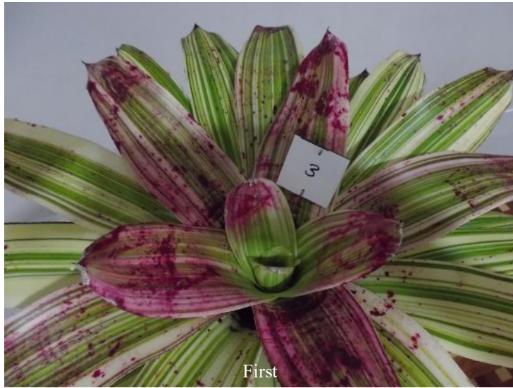
First Our Talbot Special (15 Votes) Sue Murray