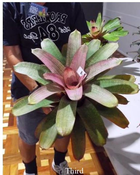
Green Line x Glutz (4 Votes) Greg Jones