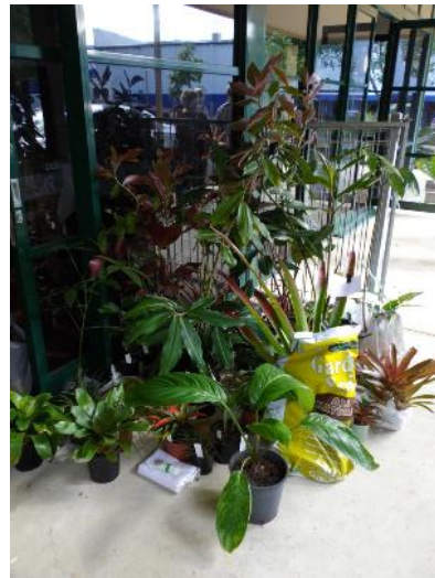
Good collection of Raffle Plants