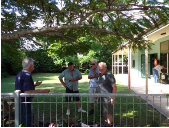
Pre Meeting Plant Discussion