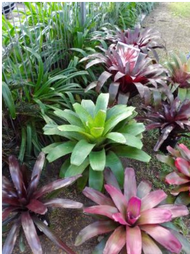
Plants for sale by members