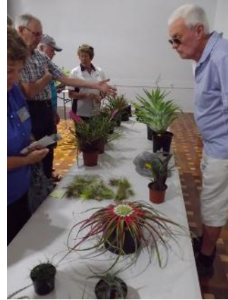
Something of Interest