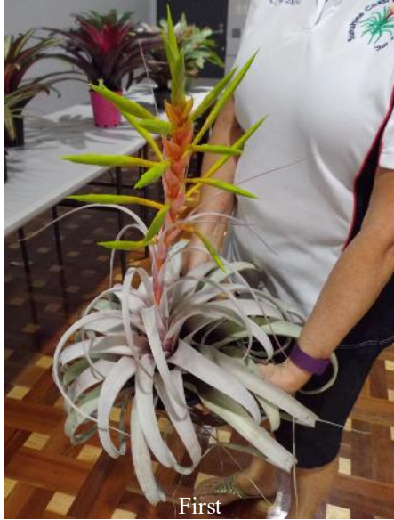
Till. xerographica (8 Votes) Cheryl Basic