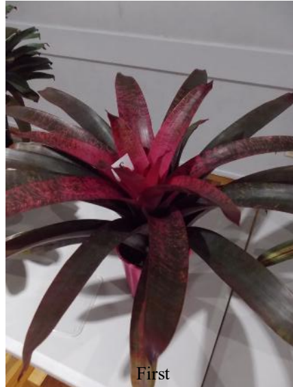
Star (19 Votes) Sue Murray