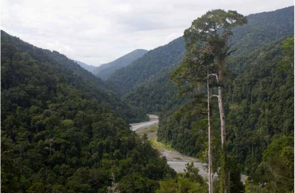
Fig. 32. Wariori River, NW Arfak Mountains, habitat of several species mentioned in this paper.