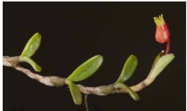
Fig. 28. Mediocalcar pygmaeum , flowering plant. After Schuiteman 2014-7 .

The type of the synonym M. crassifolium was collected by Gjellerup in the Arfak Mountains. Although this is a widespread species in New Guinea, it is not often seen, and there are no published photographs of it, to our knowledge. The commonly cultivated and quite distinct M. decoratum Schuit. used to be misidentified as M. pygmaeum before it was recognized as a new species.