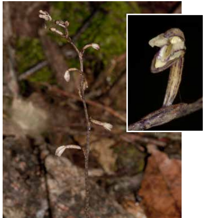
Fig. 3. Aphyllorchis pallida , in situ. After Schuiteman 2014-77 . Fig. 4 (inset). Aphyllorchis pallida , flower. After Schuiteman 2014-77 .