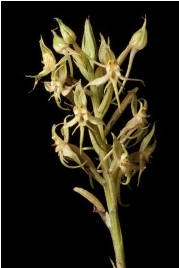
Fig. 27. Habenaria stenopetala , inflorescence. After Schuiteman 2014-68 .

Distribution. India, Nepal, Bhutan, Myanmar, China, Thailand, Vietnam, Taiwan, Philippines, New Guinea (Indonesia).