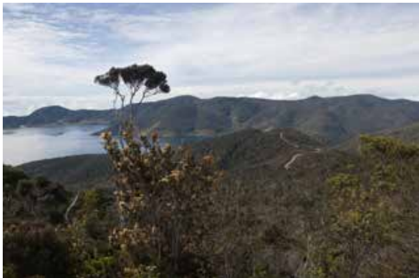
Fig. 17. Anggi Gita Lake. Dendrobium latipetalum occurs in open places around the lake.

This beautiful terrestrial orchid, which can be up to a metre tall (Gibbs, 1917, as D. rhomboglossum ), is still fairly common in open places around the Anggi Lakes (Fig. 17) between 1800 and 2650 m. It is not clear to us why J.J. Smith described this member of sect. Latouria