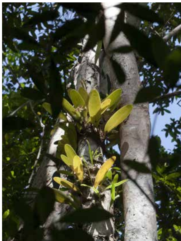
Fig. 6. Bulbophyllum hortorum , in situ. After Schuiteman 2014-51 .

Arfak material examined. Ransiki area, foothills of the Arfak Mts near Nij village, 240 m, somewhat stunted and rather open primary rainforest on ridge crest, epiphyte on tree trunks, often close to the ground, locally common, 28/07/2014, Schuiteman 2014-51 , with Marie Briggs, Frandz Rumbiak Pawere, Darius Tirbo and Victor Simbiak (BO, K, MAN).