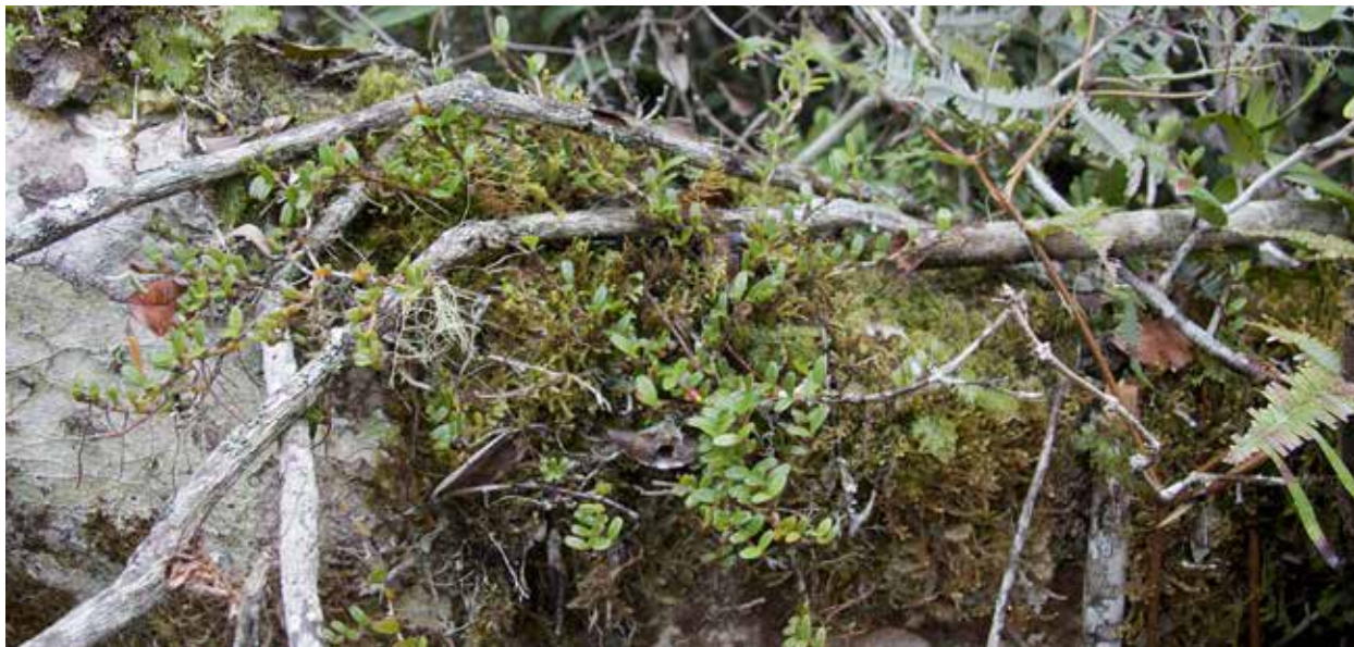
Fig. 29. Medicalcar pygmaeum , in situ. After Schuiteman 2014-7 .