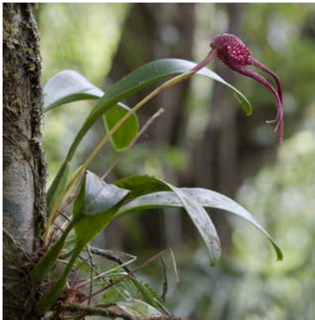
Fig. 5. Bulbophyllum elephantinum , in situ. After Schuiteman 2014-42 .

The type of this uncommon and striking species of section Hyalosema was collected in 1912 by K. Gjellerup near the Anggi Lakes at 1900 m. We found a single flowering specimen, with the flower almost past anthesis.