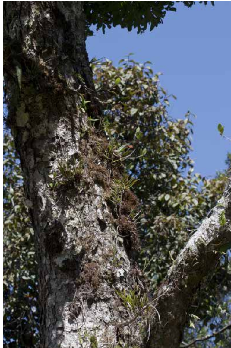
Fig. 21. Dendrobium spiculatum , in situ.