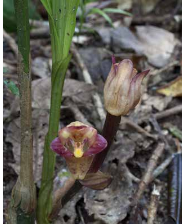
Fig. 2. Acanthephippium splendidum , in situ. After Schuiteman 2014-83 .

Arfak material examined. NW Arfak Mts, near Wariori River, 880 m, primary forest on steep slope, terrestrial in shade near fallen tree, 02/08/2014, Schuiteman