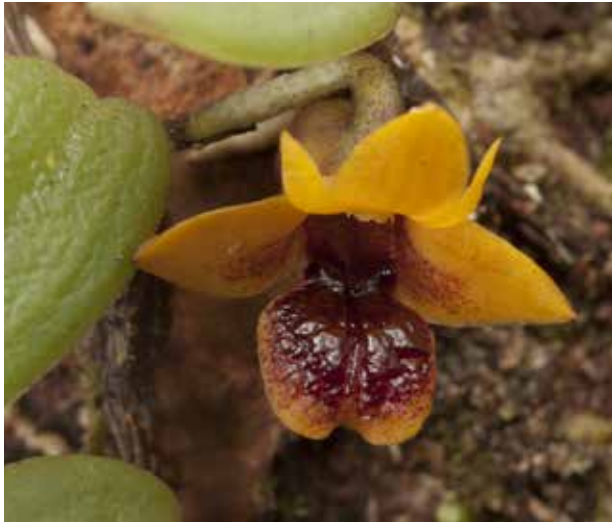
Fig. 15. Dendrobium bulbophylloides , in situ. After Schuiteman 2014-66 .

Our new record from the Arfak Mountains represents a considerable range extension for this species, which was not known to occur west of the Cyclops Mountains near Jayapura. It belongs to sect. Microphytanthe , which is at present the only known endemic section of Dendrobium in New Guinea.