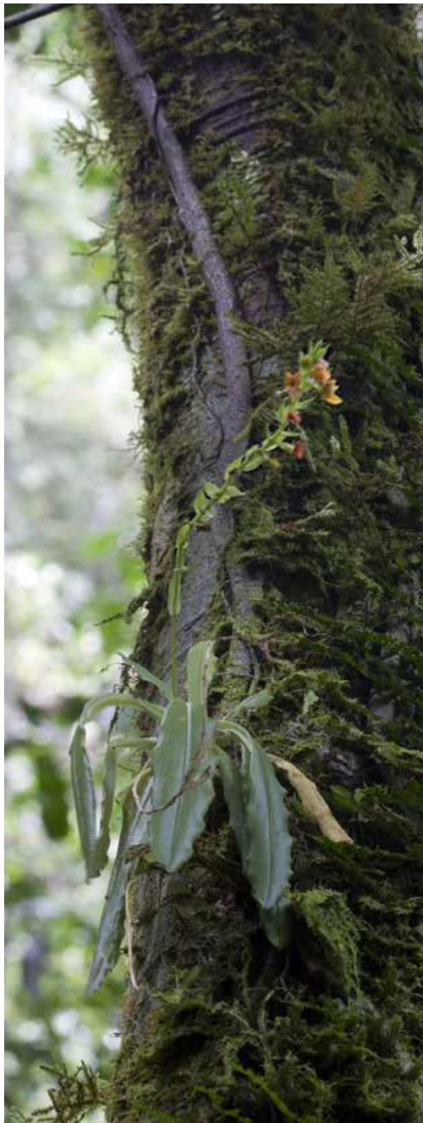
Fig. 14. Crepidium epiphyticum , in situ. After Schuiteman 2014-86 .