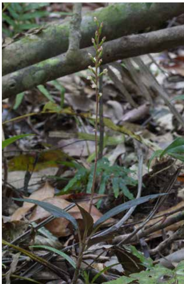
Fig. 31. Rhomboda polygonoides , in situ. After Schuiteman 2014-75 .