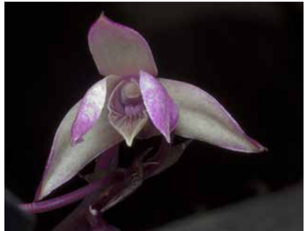
Fig. 18 (above). Dendrobium montis-yulei , cultivated ex PNG. Fig. 19 (below). Dendrobium latipetalum , flower.

the synonymy of that species. However, D. latipetalum differs in the much taller inflorescences, with the internodes between the peduncle-scales several times longer than the peduncle scales (versus internodes between the peduncle scales shorter than the peduncle scales), obovate-oblong petals (vs. spatulate petals), and smaller flowers (lip c. 2 cm long vs. lip c. 3 cm