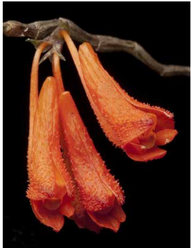
Fig. 23 (above). Dendrobium spiculatum , in situ. After Schuiteman 2014-6. Fig. 24 (below). Dendrobium spiculatum , flowers. After Schuiteman 2014-6.