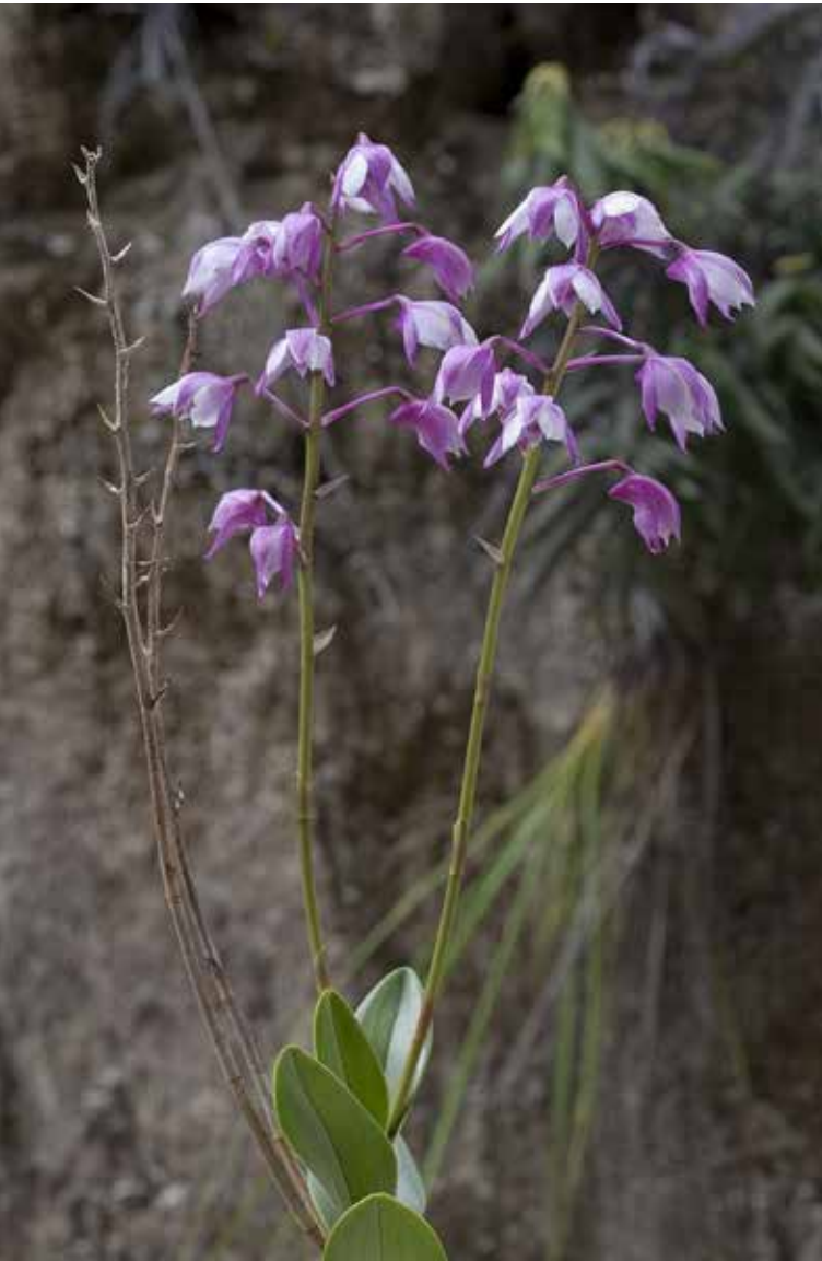
Fig. 20. Dendrobium latipetalum , inflorescences.

Epiphytic or terrestrial herb . Roots c. 1 mm diam., branching, tips orange. Stems tufted, prostrate-ascending (when growing in the shade) to erect (in