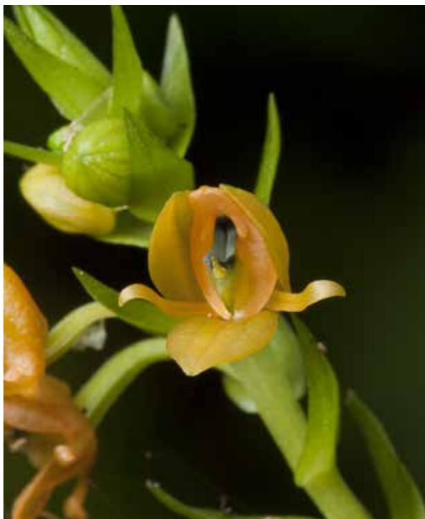
Fig. 13. Crepidium epiphyticum , flower. After Schuiteman 2014-86 .

This lowland species is noteworthy for being one of very few epiphytic species in the genus Crepidium . The horn-like projection on the column and the bluish colour of the column-arms identify this as a representative of subgen. Pseudoliparis , of which it is the type species. Crepidium epiphyticum is a new record for the Bird's Head Peninsula.