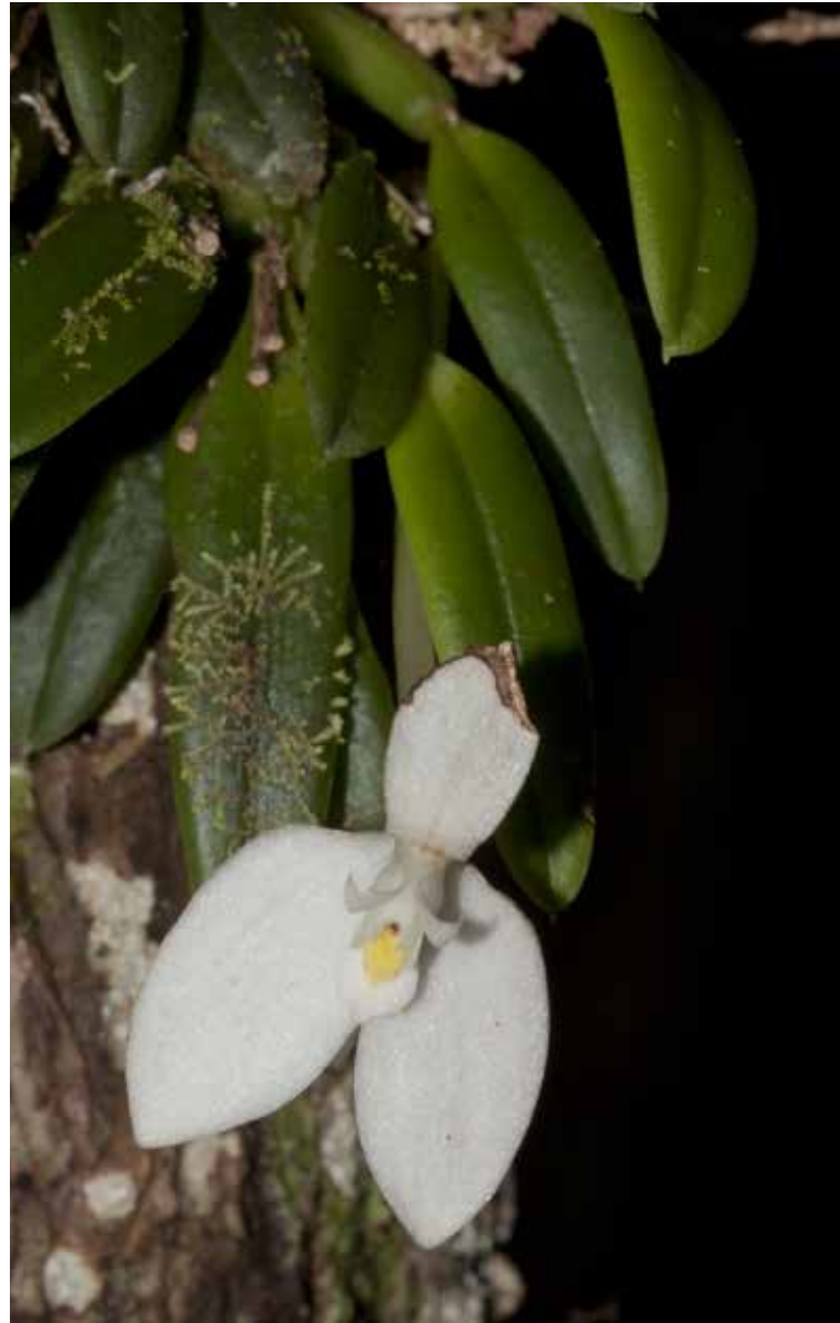
Fig. 16. Dendrobium fluctuosum , in situ. After Schuiteman 2014-59 .

The name Dendrobium citrinum Ridl. cannot be used for this species because of the earlier D. citrinum W. Bull., a name (and synonym of D. heterocarpum Wall. ex Lindl.) overlooked by the compilers of Index Kewensis . Dendrobium fluctuosum is the largest-flowered species of sect. Cadetia , with pure white flowers (apart from a greenish callus on the lip) up to 2.5 cm across. The slender, spur-like mentum suggests that it is pollinated by moths. This is the first record from the Arfak Mountains, although an entirely predictable one, given the occurrence of this species in the nearby Tamrau Mountains and the Wandamen Peninsula.