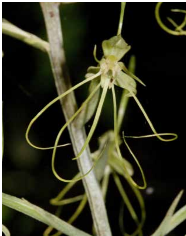
Fig. 26. Habenaria dryadum , flowers. After Schuiteman 2014-49 .

Habenaria dryadum Schltr. var. major Schltr., Repert. Spec. Nov. Regni Veg. Beih. 1: 15 (1911).