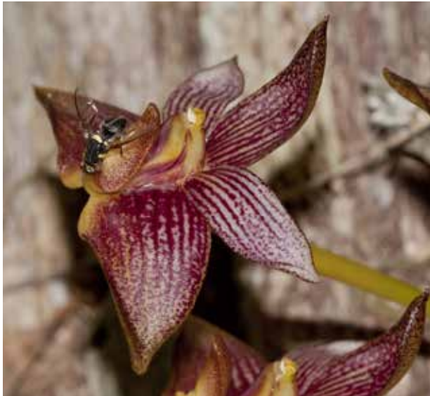
Fig. 7. Bulbophyllum hortorum , flowers with fruit fly. After Schuiteman 2014-51.

All the flowers we observed in situ were continuously being visited by black-and-yellow fruit flies, often three or four at the same time.