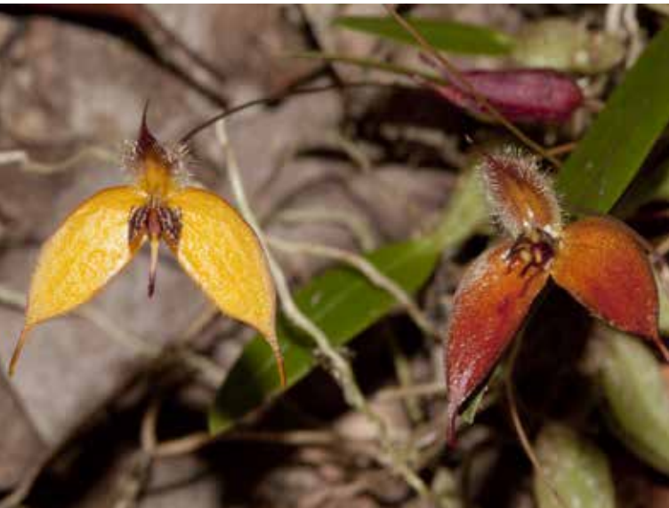
Fig. 11 (above). Bulbophyllum nasica , in situ. After Schuiteman 2014-52 . . Fig. 12 (right). Bulbophyllum pristis , inflorescence. After Schuiteman 2014-43 .

This pretty little species of sect. Polymeres is common and widely distributed in New Guinea and has a remarkably broad altitudinal range, from 50 to at least 1900 m, and possibly up to 2900 m (Schuiteman et al., 2010). Although it was already known from the central part of the Bird's Head Peninsula, this is the first record from the Arfak Mountains. It is interesting to note that two colour forms were growing intermixed here: some specimens had red-brown and others bright golden yellow lateral sepals.