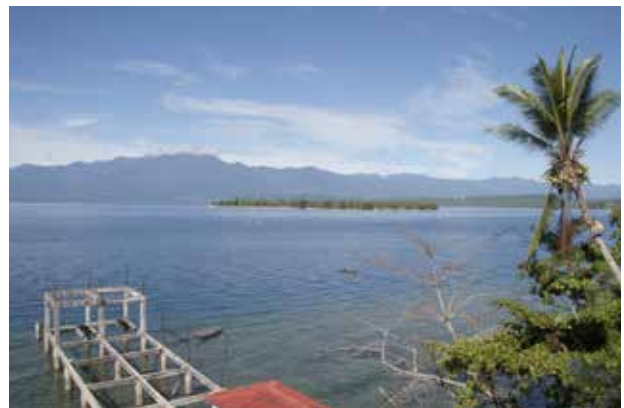
Fig. 1. The Arfak Mountains seen from Manokwari, with Lemon Island in the middle distance.