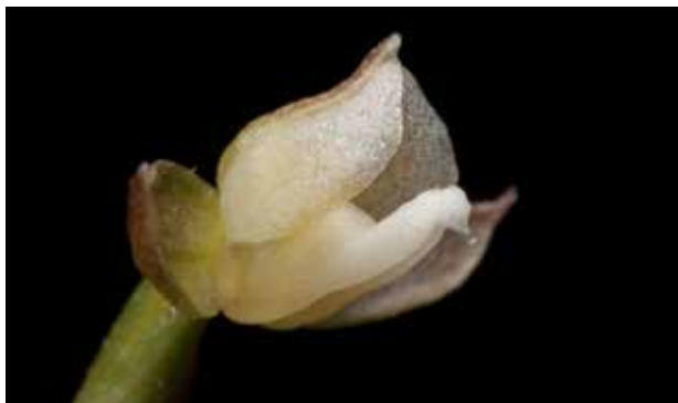
Fig. 30. Rhomboda polygonoides , flower. After Schuiteman 2014-75 .

This appears to be the first record from the Bird's Head Peninsula.