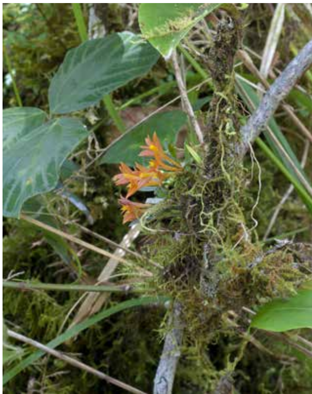
Fig. 25. Dendrobium subacaule , in situ.

Distribution. Moluccas, New Guinea (Indonesia; PNG), Solomon Islands.