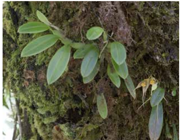
Fig. 8 (above). Bulbophyllum minutipetalum , flowers. After Schuiteman 2014-16. Fig. 9 (below). Bulbophyllum minutipetalum , in situ. After Schuiteman 2014-16.