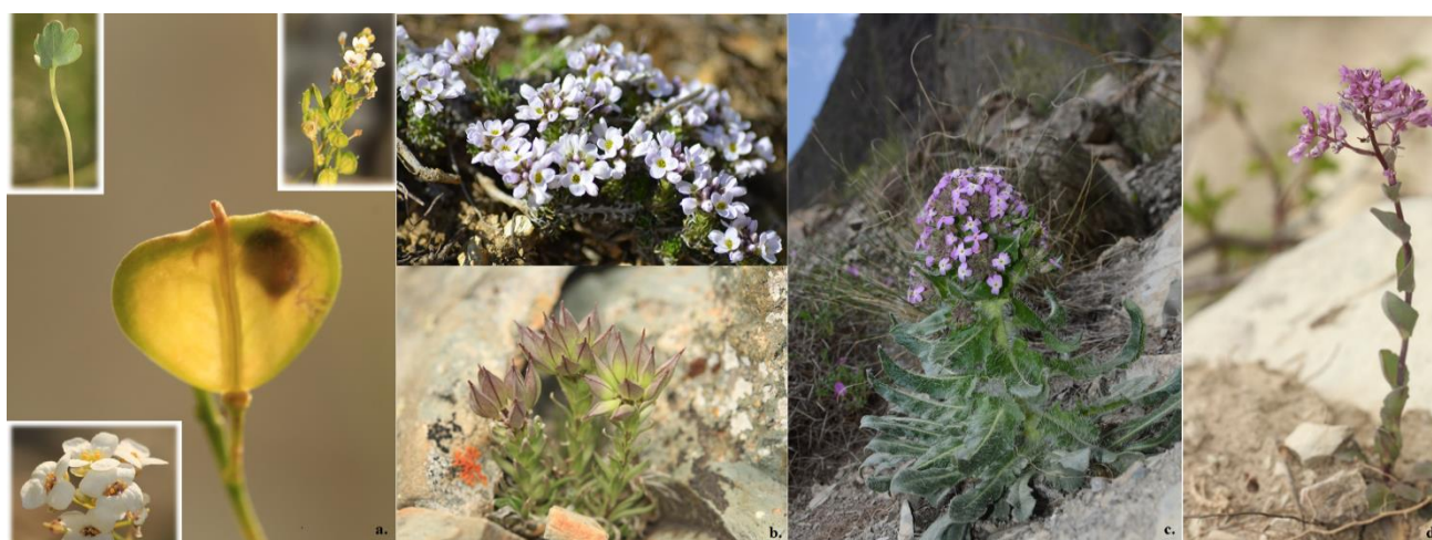
Fig. 3. Taxa of Brassicaceae that endemic for Bayburt (a). Heldreichia bupleurifolia Boiss. subsp. rotundifolia (b). Aethionema caespitosum (c). Tchihatchewia isatidea (d). Thlaspi lilacinum .