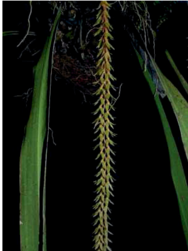
Figure 2: Habit of the inflorescence.