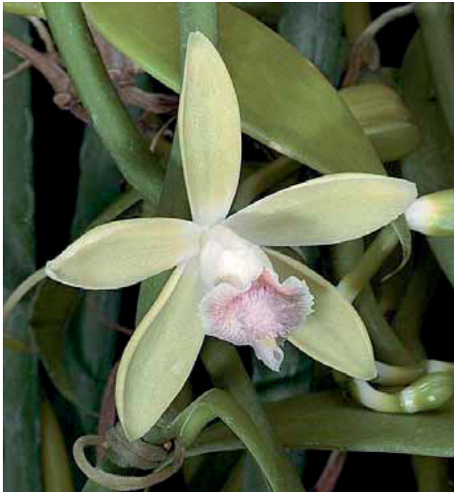
Fig. 5. Vanilla borneensis .