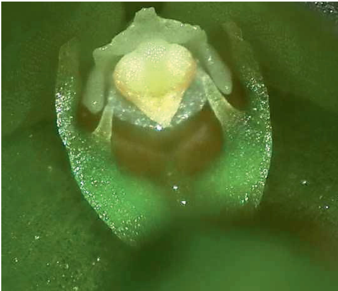
Figure 1: Showing the feature for which the plant is named - the green flower and the horns on the labellum.