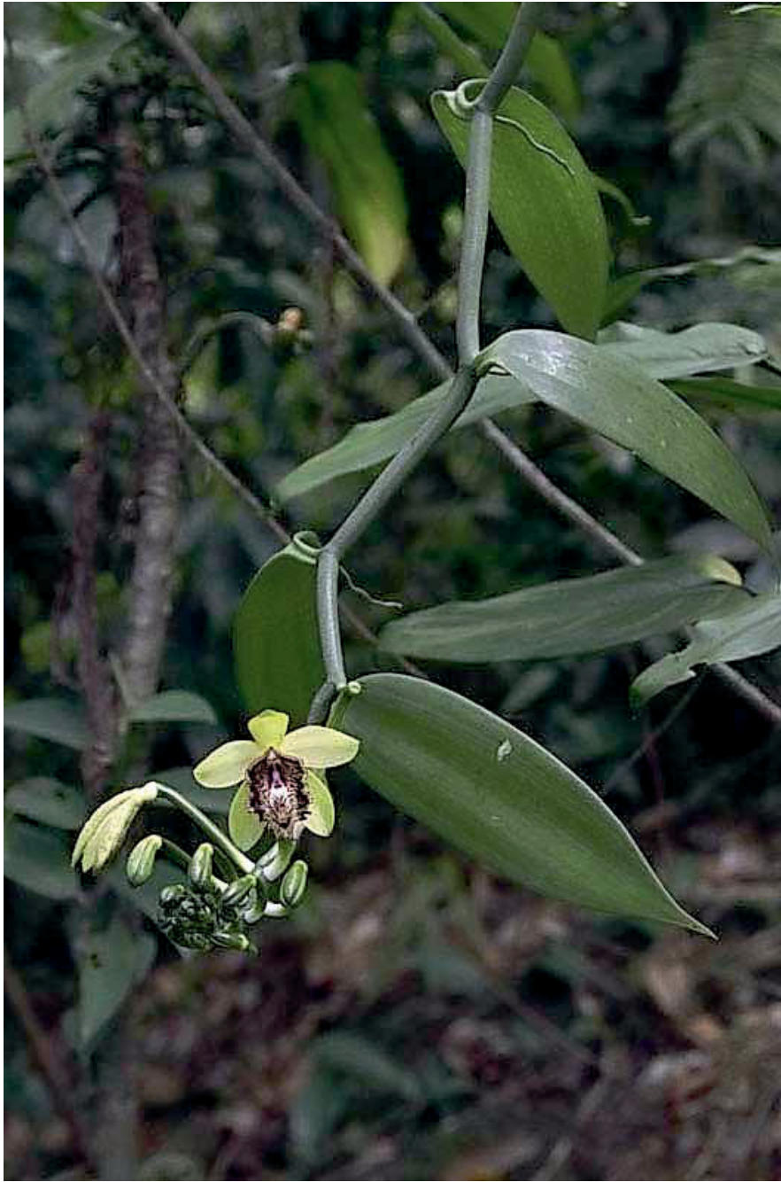
Fig. 1. Vanilla atropogon in situ.