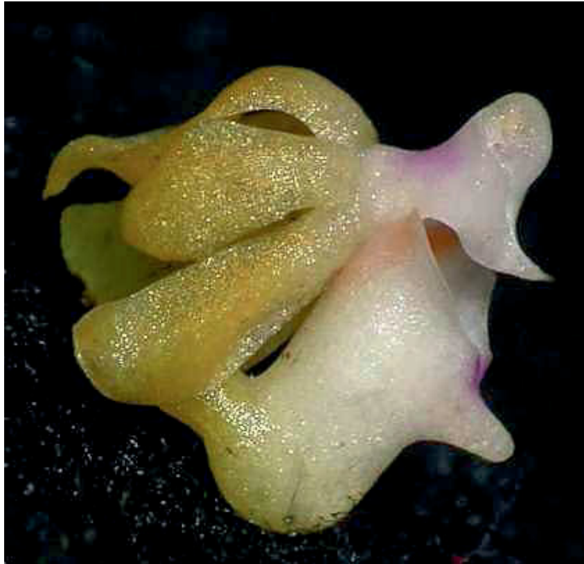
Close-up of the flower of Malleola reflexa Boos and Cootes