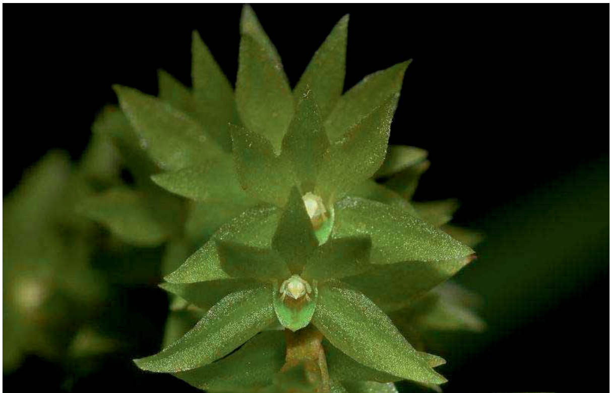
Figure 3: The flowers.