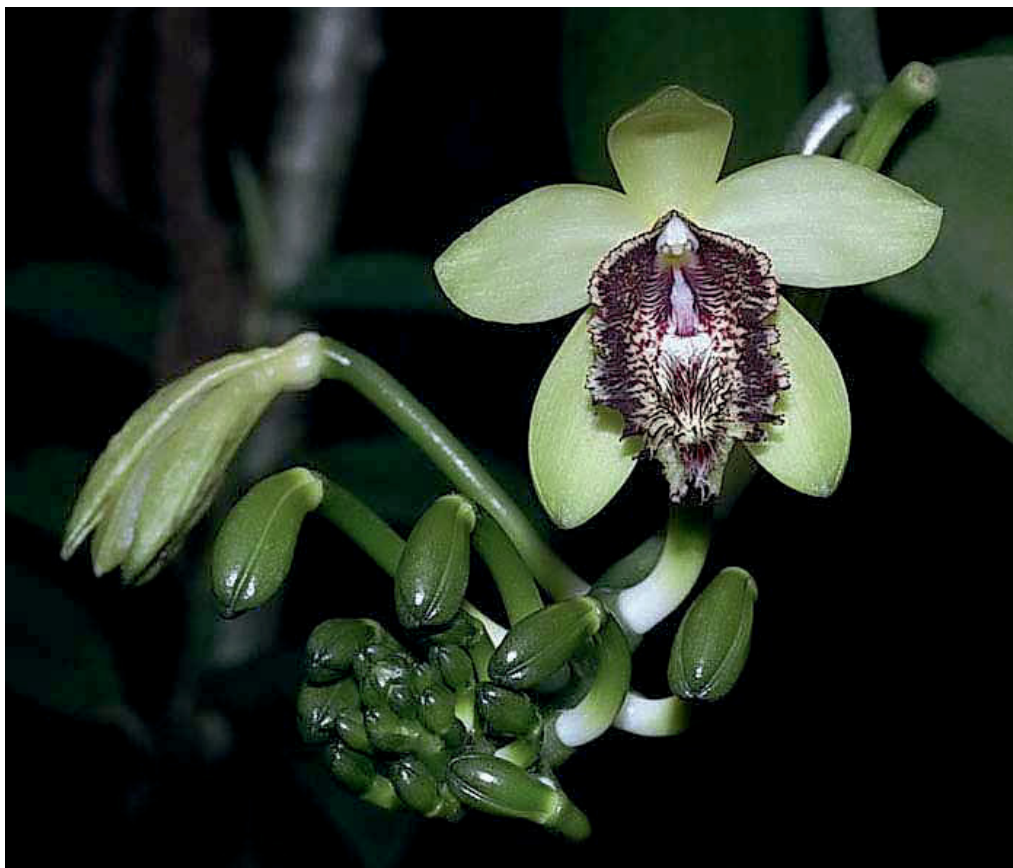
Fig. 2. Vanilla atropogon , inflorescence.