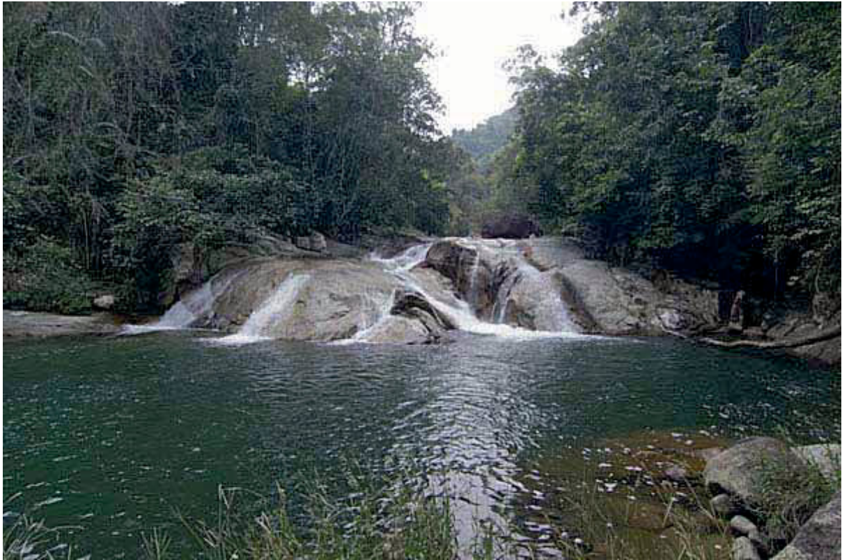
Fig. 4. Habitat of Vanilla atropogon , Hon Ba Nature Reserve.