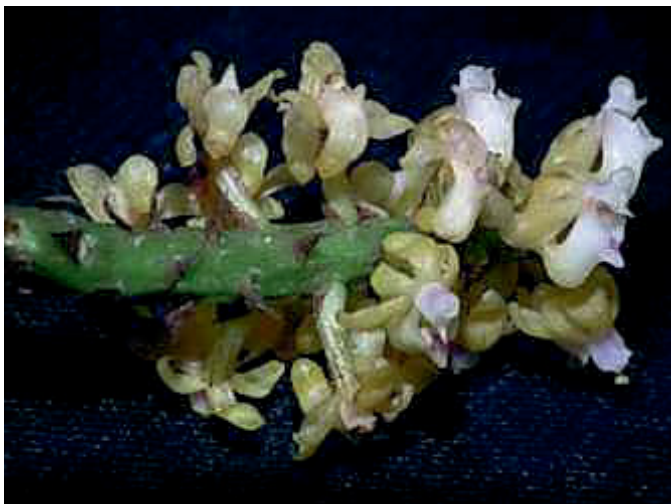
The inflorescence of Malleola reflexa , showing the reflexing floral segments, for which this species is named.